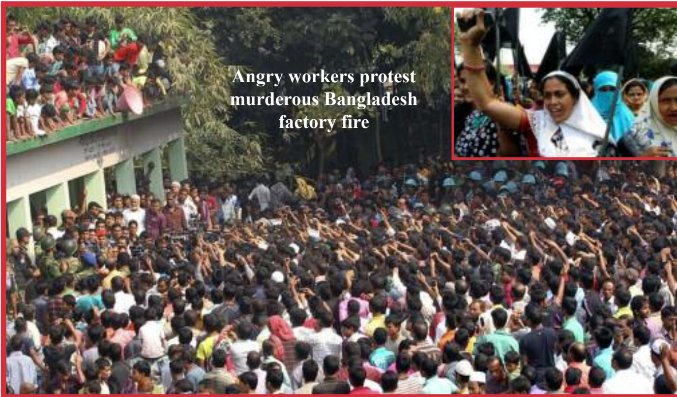
Angry workers protest murderous Bangladesh factory fire

International Communist Political School: