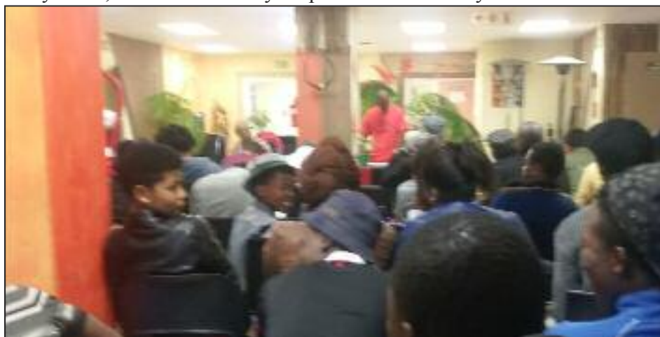
Youth in ICWP conference in South Africa

Red Flag is an important tool in the process of mobilizing the masses for communism. Let's distribute it, study it and write for it. Join the fight for a communist world!