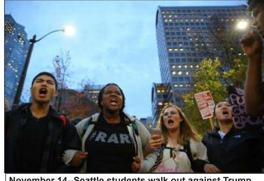
November 14--Seattle students walk out against Trump

"Democracy" and "dictatorship" are intercon-