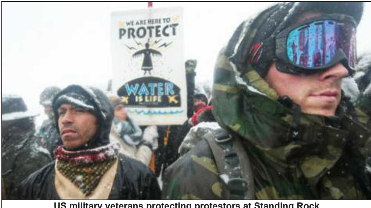
US military veterans protecting protestors at Standing Rock

Communism will erase national borders. It will develop mass consciousness of our mutual interdependence. A growing international party means the emergence of collective wisdom on a scale we can scarcely imagine. But let's begin and non-indigenous clergy supporters pushed