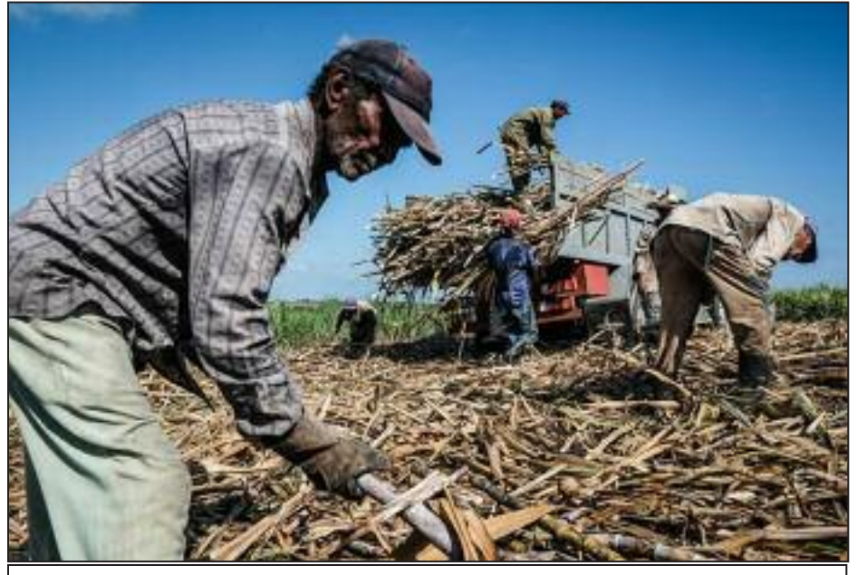
Sugar cane workers on private farm, Caimito, Cuba, 2014

While Cuba's main source of revenue is remittances, Cuban doctors abroad now bring in more revenue than the traditionally most profitable industry: sugar.