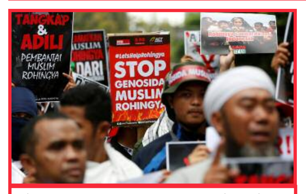
Above: Protest against Burmese government attacks on Rohingya Muslims, Jakarta (Indonesia), November 16, 2016

THE INTERNATIONAL COMMUNIST WORKERS' PARTY * WWW.ICWPREDFLAG.ORG