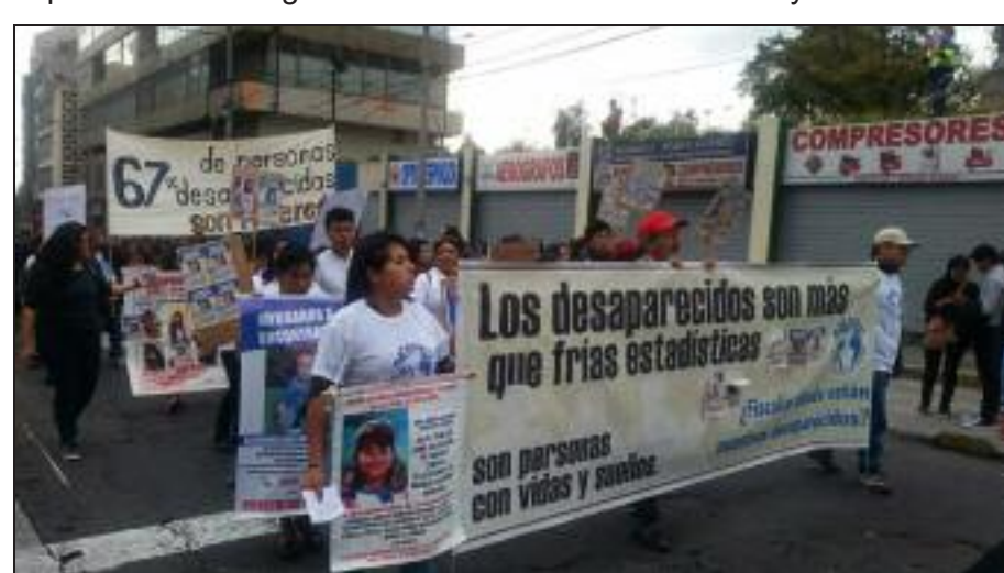
Ecuador: Fighting Violence Against Women

Communism, like feminism, insists that nobody "needs to put up with anything or anyone" who treats them badly. That's why communists in the Soviet Union and China moved quickly to expand women's right to divorce.