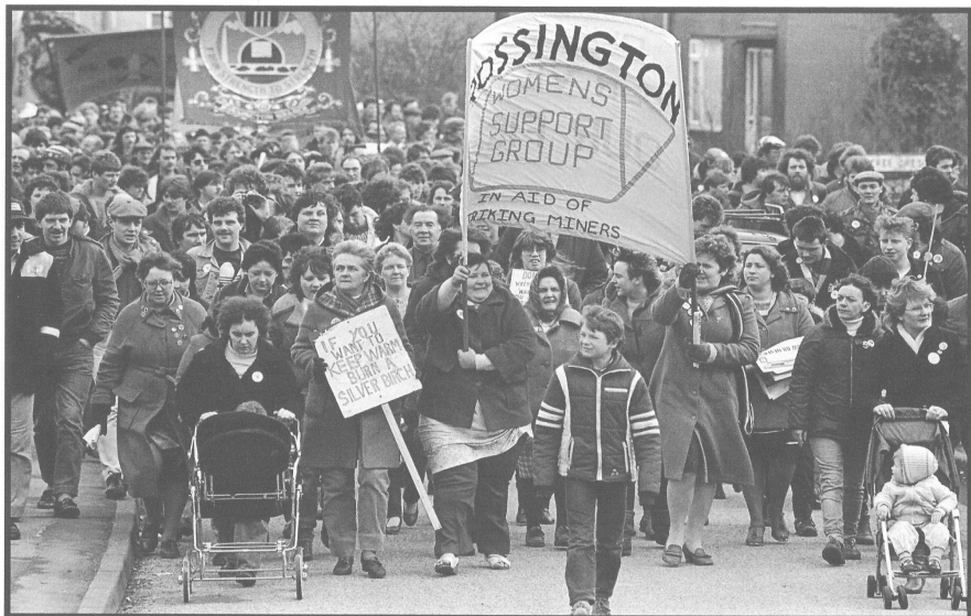
THE END: Miners' support group leads a demonstration of strikers at Rossington pit village before the return to work after the miners had decided to end their year-long strike.