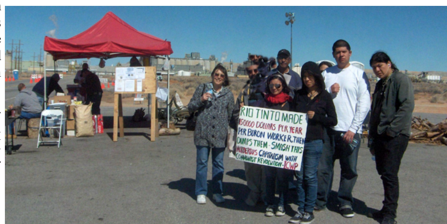
March, 2010—Students and Teachers Support Miners Rio Tinto

These two show the potential. Step by step workers can reject bosses’ reasoning if the logic of a revolutionary communist alternative is fought for in the midst of class struggle.