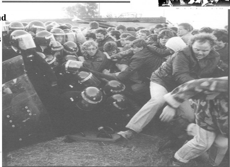
the ground during a mass picket at Kellingley colliery in North Yorkshire.