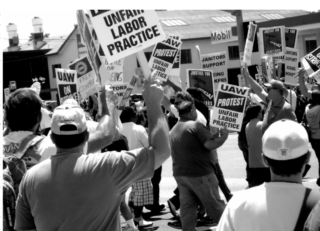
LONG BEACH-MAY 14, 2010 – BOEING STRIKERS

The communist ideas in Red Flag have been guaranteed in this workplace, and some workers are willing to participate in study groups. As we've mentioned in previous articles, there is much sympathy for communism, but also some workers lack confidence and accurate information. Nevertheless, the articles about what is communism, the scientific and historical explanation of the development and struggle of the working class and its communist party open a whole new world of teaching and political education