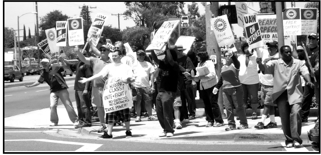
RED FLAG JOINS BOEING WORKERS AND SUPPORTERS ON THE PICKET LINE

Seventeen hundred Boeing workers, We told strikers that reformism and is demanding that workers pay 35% of sors. health costs by the end of their contract and accept pension reductions.