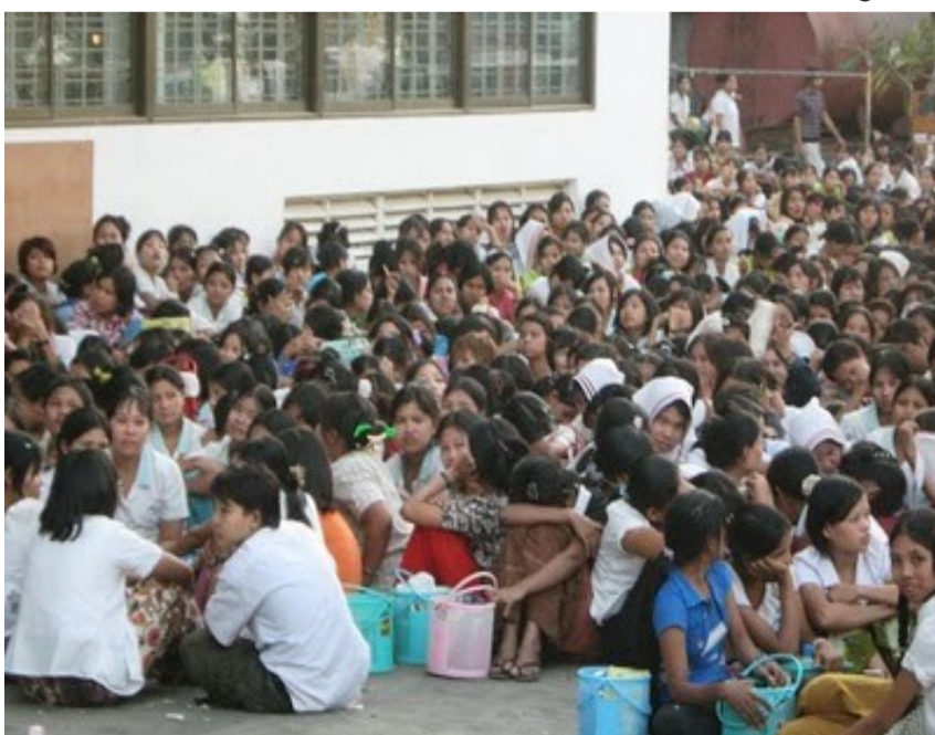
Burmese garment workers on strike—April 2010

Capitalism creates and thrives on wage slavery. The bosses need racism to divide the working class and pay some workers less to drive all workers’ wages down. Racism against immigrant workers is part of capitalism’s attack on the whole working class. The current capitalist crisis makes this attack sharper. To get rid of wage slavery and exploitation we have to get rid of capitalism with communist revolution. The only way out of the capitalist inferno is to build a communist society where everyone contributes to the society and everyone shares abundance and scarcity, without wages or exploitation.