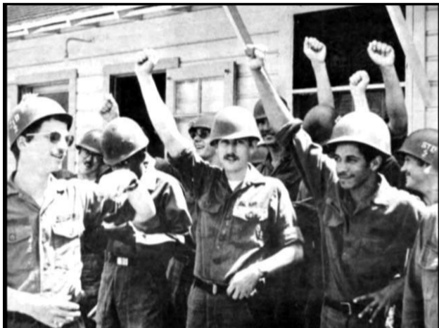
Soldiers Rebel Against Racism During Viet Nam War

NEWSPAPER OF THE INTERNATIONAL COMMUNIST WORKERS' PARTY * ICWPREDFLAG.ORG