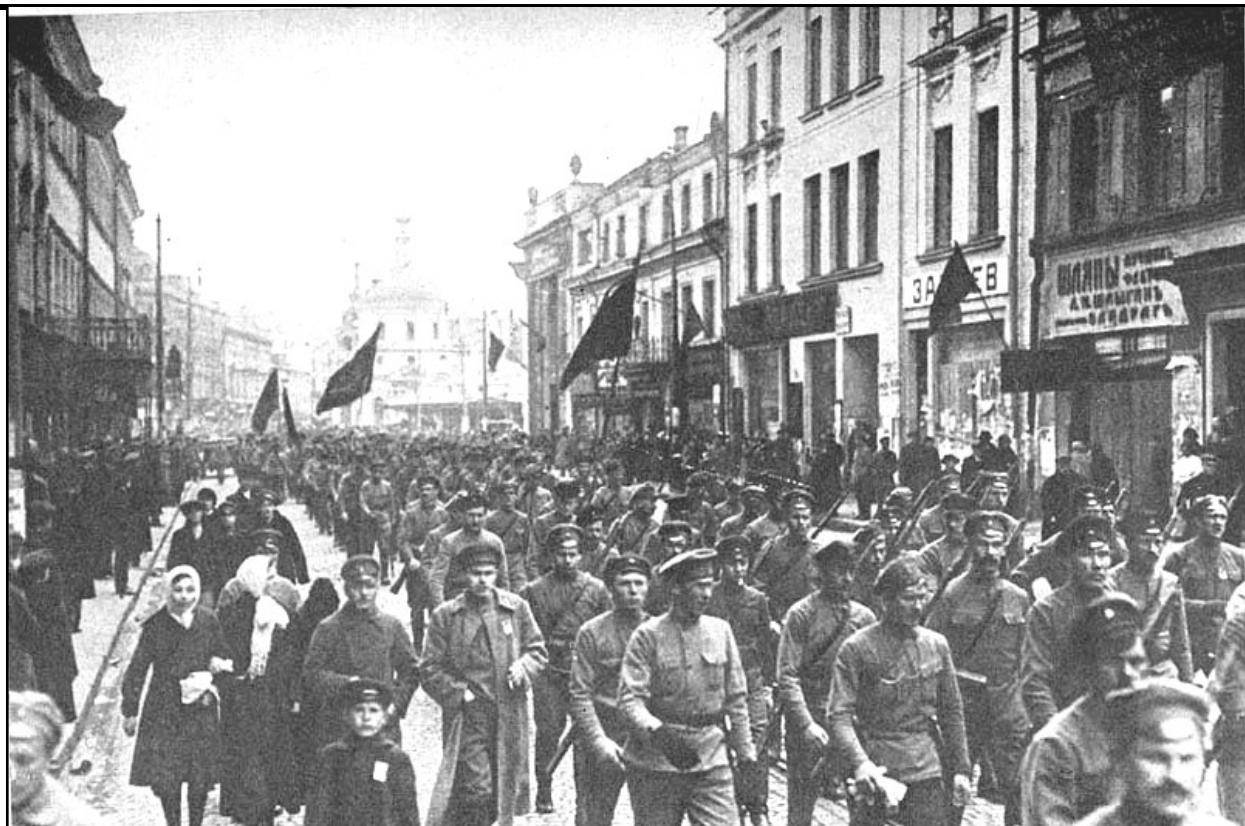
Bolshevik Regiments Marching to Smolnyi (1918) - Banners read, “Long Live the Revolution!”

It's our task, in the face of impending world war, to defeat revisionism, including its nationalism and its “two-stage” theory of revolution. We must build the INTERNATIONAL COMMUNIST WORKERS' PARTY and prepare to turn the bosses' imperialist wars into communist revolution.