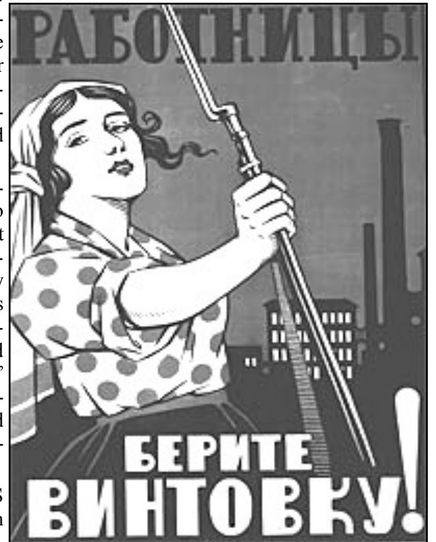
“Women workers take up your rifles” Bolshevik poster, 1917