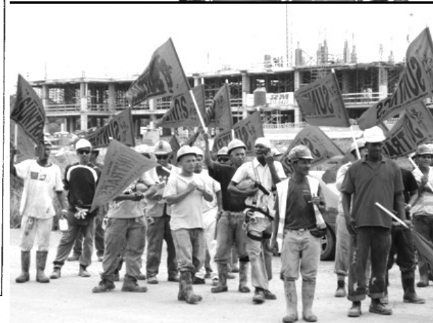
PANAMA, July, 2010--Construction workers on strike