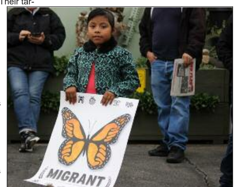
PASADENA, CA (US), Feb. 28 -- Hundreds marched in solidarity, demanding that city officials refuse to help federal officials enforce Trump's immigration policies. Nearly a hundred marchers took copies of Red Flag.