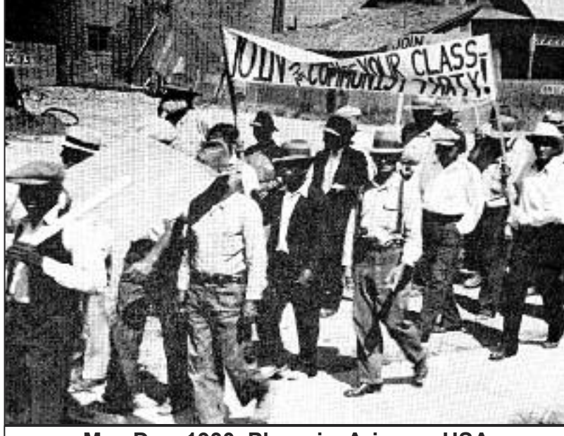
May Day, 1930, Phoenix, Arizona, USA