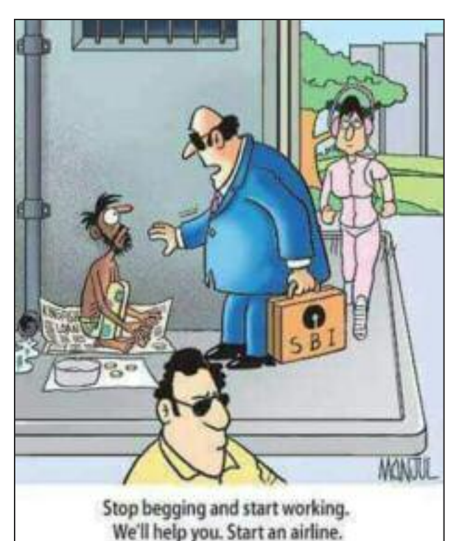
This cartoon from India Resists exposes the racism of the Modi government's "Basic Income" plans

At first there will be a lot of hard work. We'll be building communism on a planet devastated