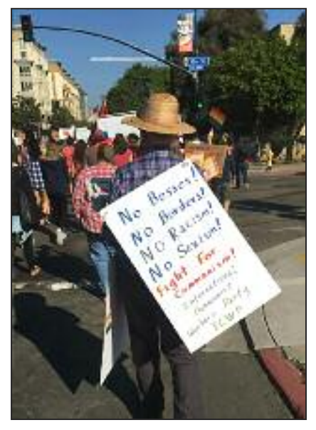
Comrades in Los Angeles and San Diego, USA, bring communist politics to International Women's Day activities