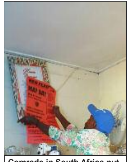
Comrade in South Africa putting our May Day poster over his House of Prayer poster

Much of that knowledge could be useful to the masses once we have power. In capitalist society, however, it has always been the working