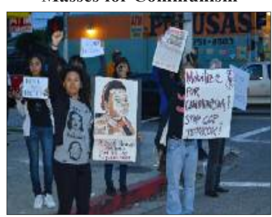
Pamphlet available at icwpredflag.org/RP/rpe.pdf

To End Racism, Mobilize the Masses for Communism