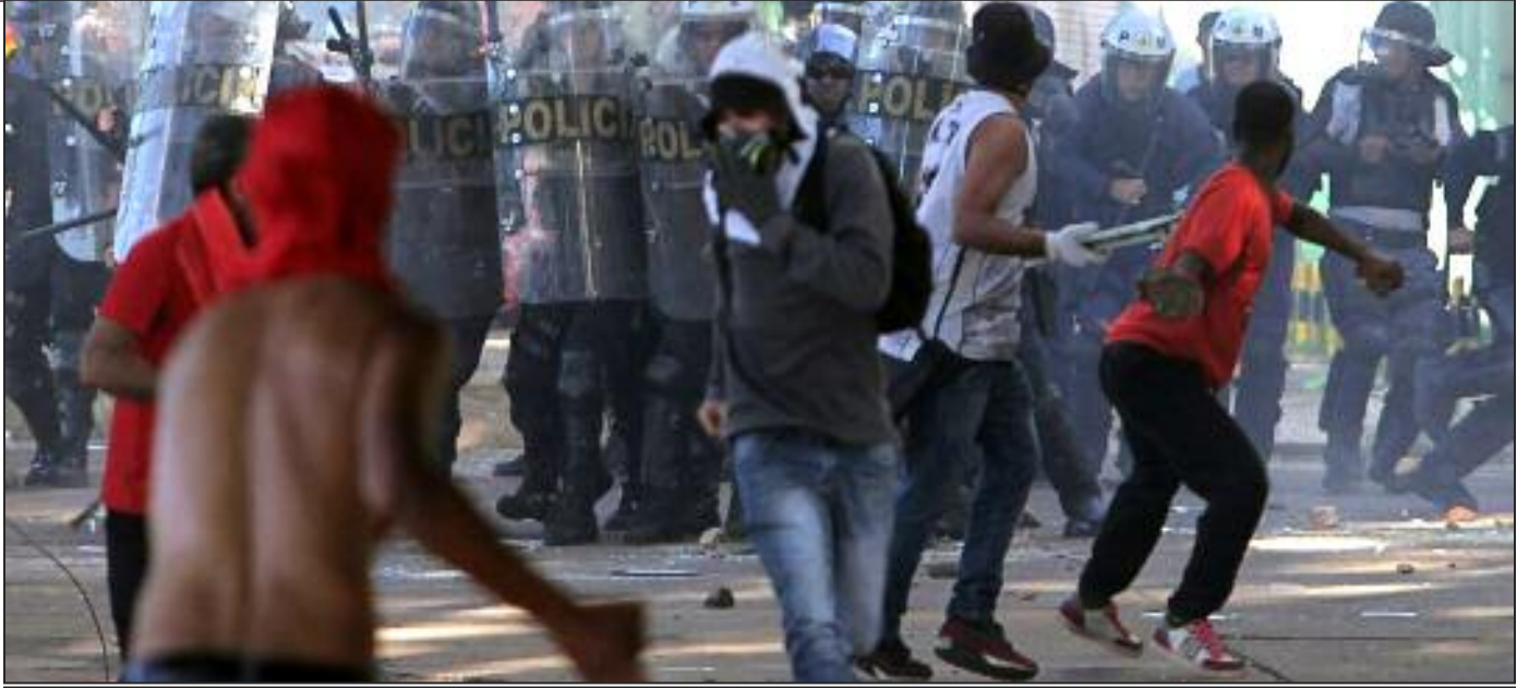
Brasilia, May 24, 2017