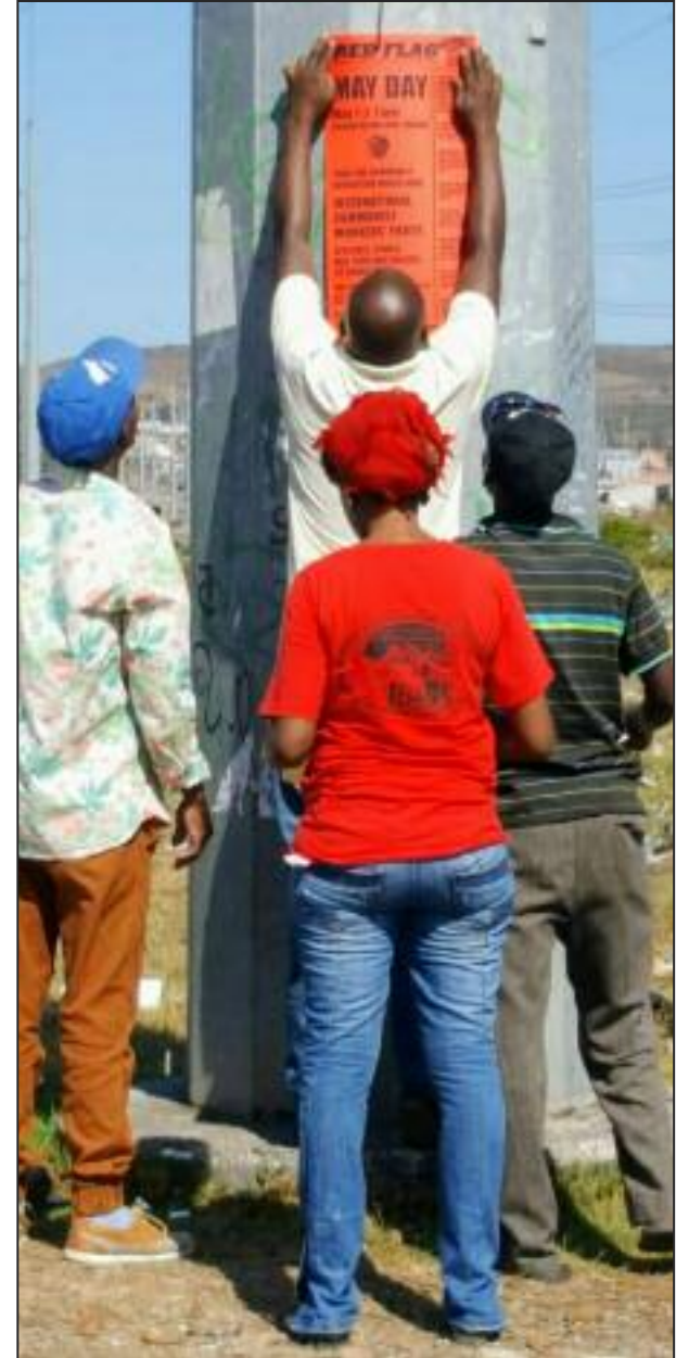
Organizing for May Day 2017

We can't say we want to abolish sexism with a collective that only consists of men. It is up to us now to struggle with the new comrades to be active and to participate in our meetings and activities in mobilizing more masses for communism.