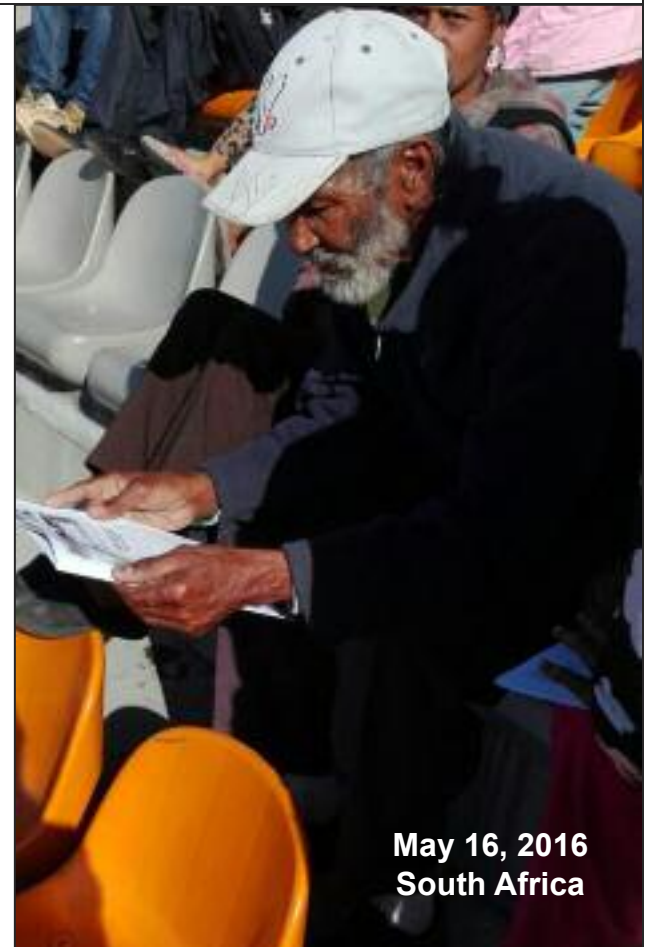
May 16, 2016 South Africa