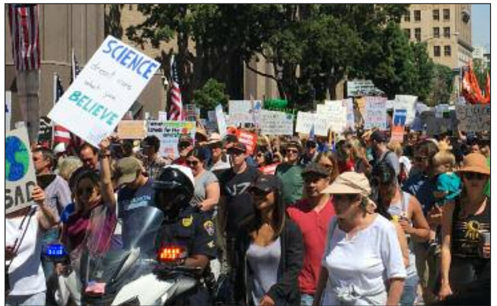
Science March in San Diego, USA

The huge Marches for Science proved that many people, some of them scientists, want a science that serves the vast masses of people and not the handful of billionaires who currently run the world. Under capitalism this remains a dream. Only communist science can make this dream real. That means remaking the world with communist revolution. If you want science for the masses, join the ICWP.