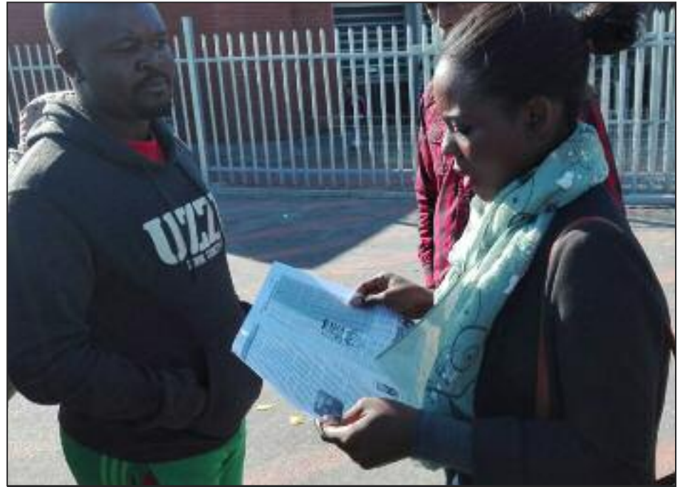
South Africa: ICWP comrades distributed Red Flag on Soweto Day (now known as Youth Day) May 16, 2016