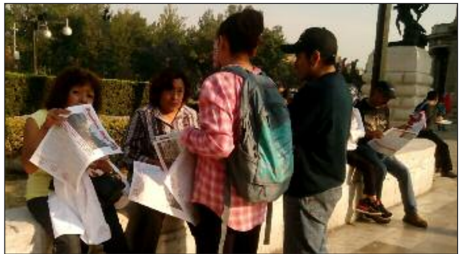
May Day, 2017, Mexico City