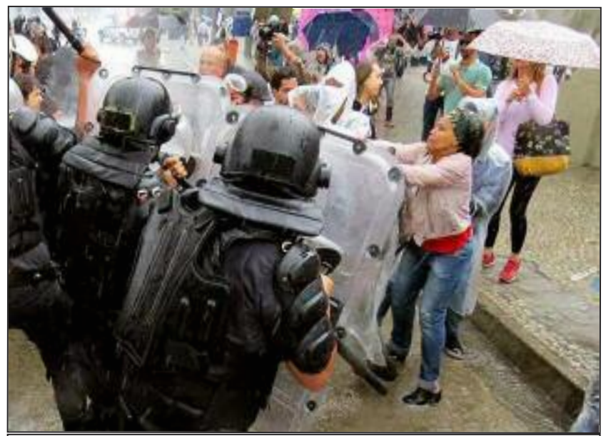
2014 Rio de Janeiro Teachers' strike

Some readers of the Red Flag in Brazil are more interested in ICWP now. Formation of ICWP groups can lead to a significant fight for communism. Brazil has the largest black working class in the world. By developing communist leadership in Brazil, we are on the path to communist revolution that will end once and for all the horrors of capitalism. Join ICWP and spread our revolutionary vison by distributing Red Flag .