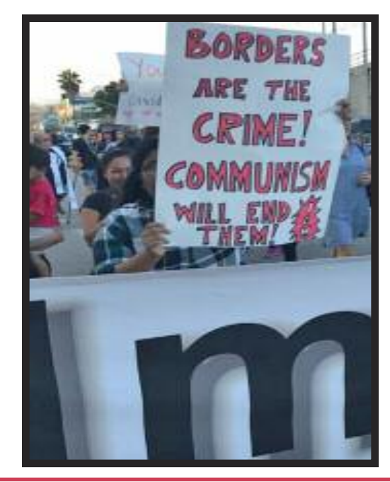
September 5—Protests erupt throughout the US over the government decision to end the DACA program which protected from deportation unauthorized immigrants who had arrived as children. SEE ARTICLE PAGE 3