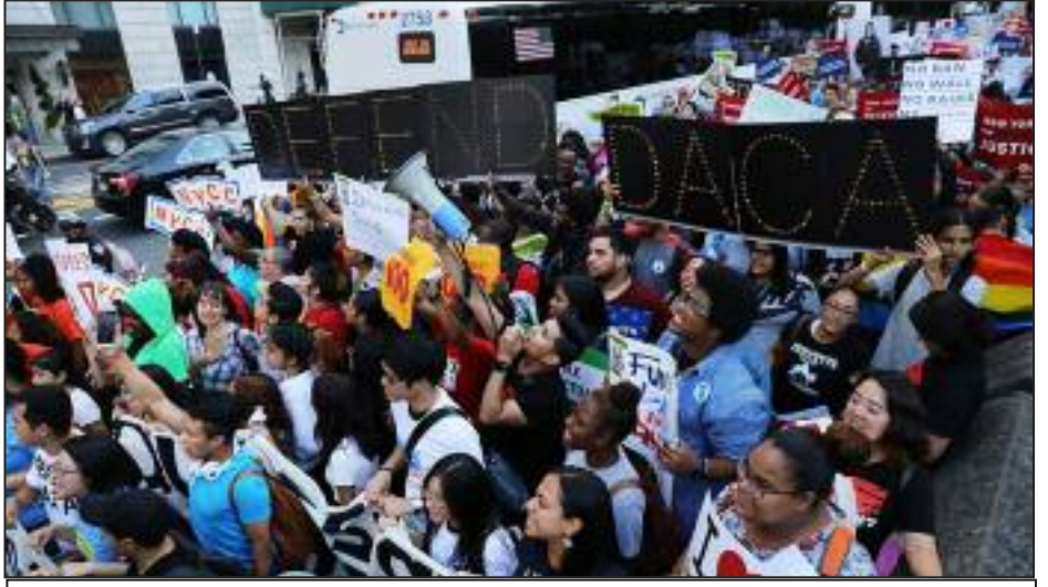
Detroit, USA—September 5