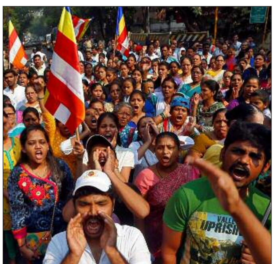
Mass protests against attacks on Dalits Mumbai, India, January 2018

Our modest efforts have shown that if we continue our work with consistency and determination, building very close ties with the working class, our party will grow quickly. Capitalism is in deep crisis. It is a weak system and it is in decline. Our party is the future. Join ICWP now and start building communist collectives!