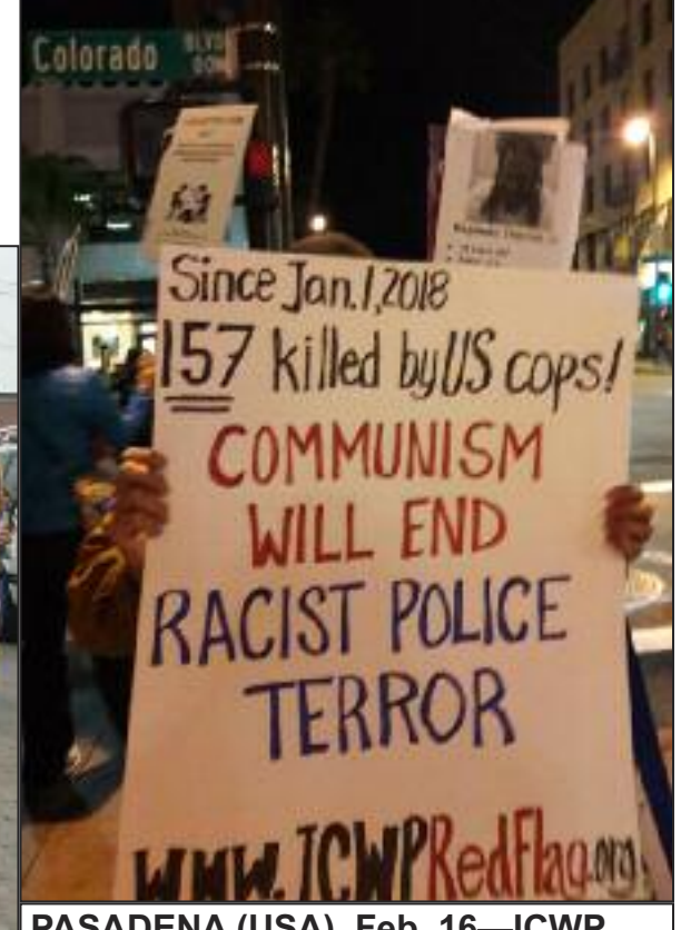
PASADENA (USA), Feb. 16—ICWP comrades join a protest against racist police brutality and murder.

tional Communist Workers' Party and help create this world in which murders by the police or the sheriffs will cease to exist.