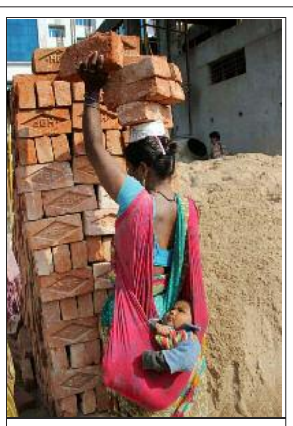
Women worker, India

and called the Immigration cops on them in the San Joaquin Valley.