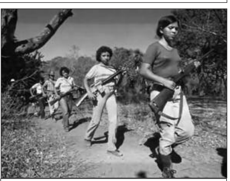
Women guerrilla fighters, El Salvador