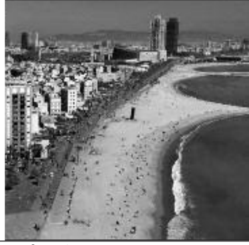
The Barceloneta Left: in the 1960s; Right: in the 1990s

need to live, and enjoy life, meeting the needs