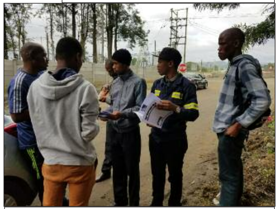
Marikana, April 2018