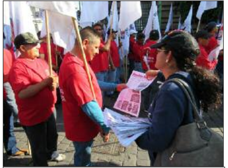
ICWP Mexico City May Day 2018