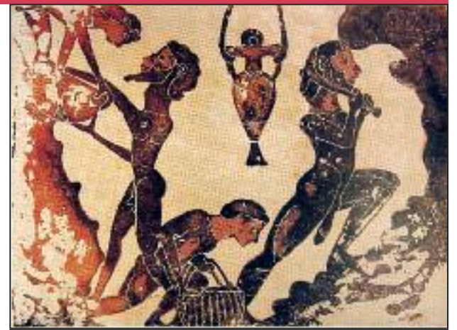
Greek slaves in the silver mines

A similar story is repeated hundreds of years later with the development of industrial capital. Modern democracy first took hold in England. Merchants, bankers and industrialists finally got the “freedom” they had been fighting for when, what the historians call the “Glorious Revolution,” triumphed in 1688. It shifted the balance