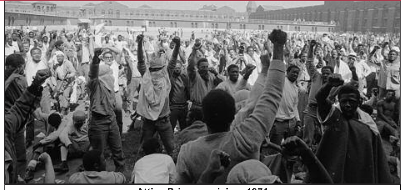
Attica Prison uprising, 1971

Although prison authorities are trying to sup-