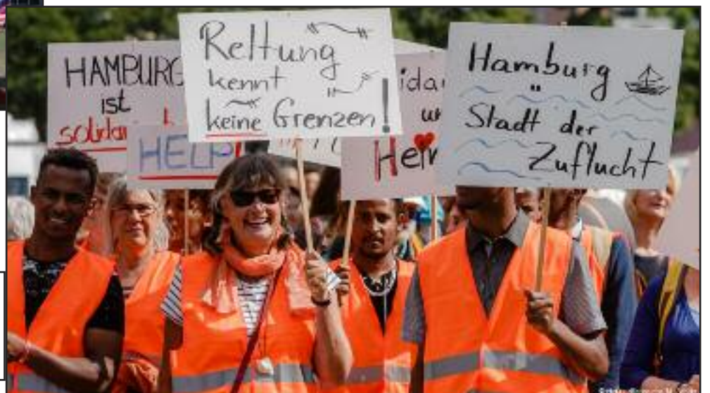
Hamburg, Germany, September 2, 2018—Pro-migrant demonstration calls for open ports and rescue of migrants at sea