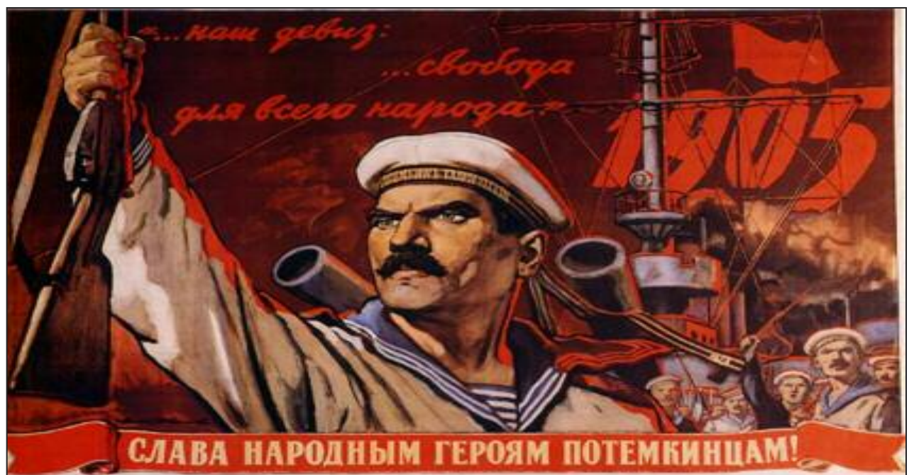
Sailors on the Battleship Potemkin played a key role in the Russian Revolution of 1905 Soldiers and sailors must mobilize for communist revolution today.

When capitalism resorts to war, the rulers have to mobilize the population to fight for them. When they are in motion, when the masses of workers, soldiers and sailors cannot survive in this system, there’s even greater opportunity to mobilize the masses for communism. During WWI, the Russian workers, sailors and soldiers, led by the Bolsheviks, took power in the Russian Revolution. Communist-led Chinese masses successfully took power after WWII. We need to build one mass ICWP to fight to turn the bosses’ imperialist war into revolutions for communism everywhere.