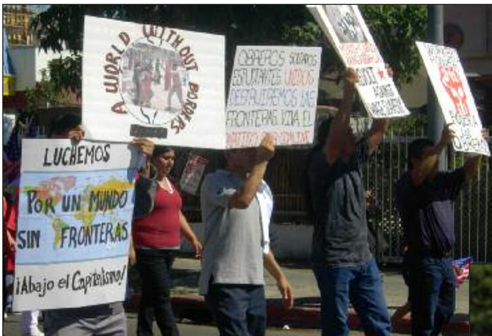
ICWP comrades in mass march against deportations in 2013. We fight for a communist world without nations or borders