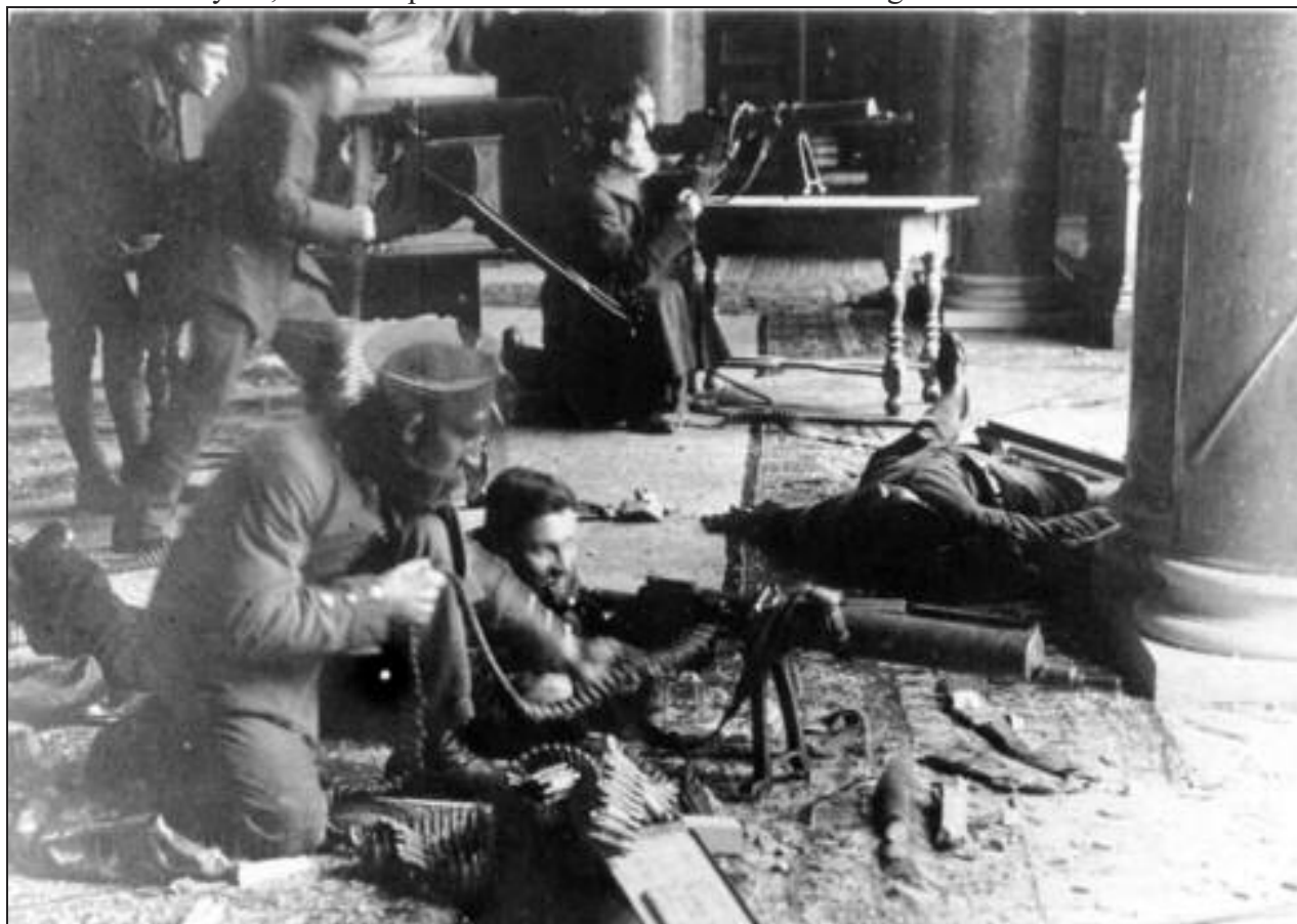
Soldiers and sailors rebel—Berlin, December 1918