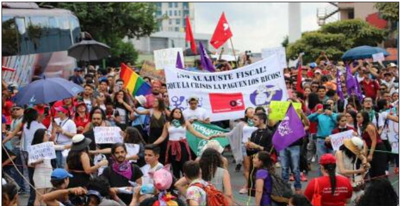
Costa Rica, Sept. 13 "No to the Fiscal Adjustment! Let the rich pay for the crisis!"

The government is saying that it is in an economic crisis and to be able to pay its internal and external debts (to international banks), it needs this plan, where workers must tighten their belts.