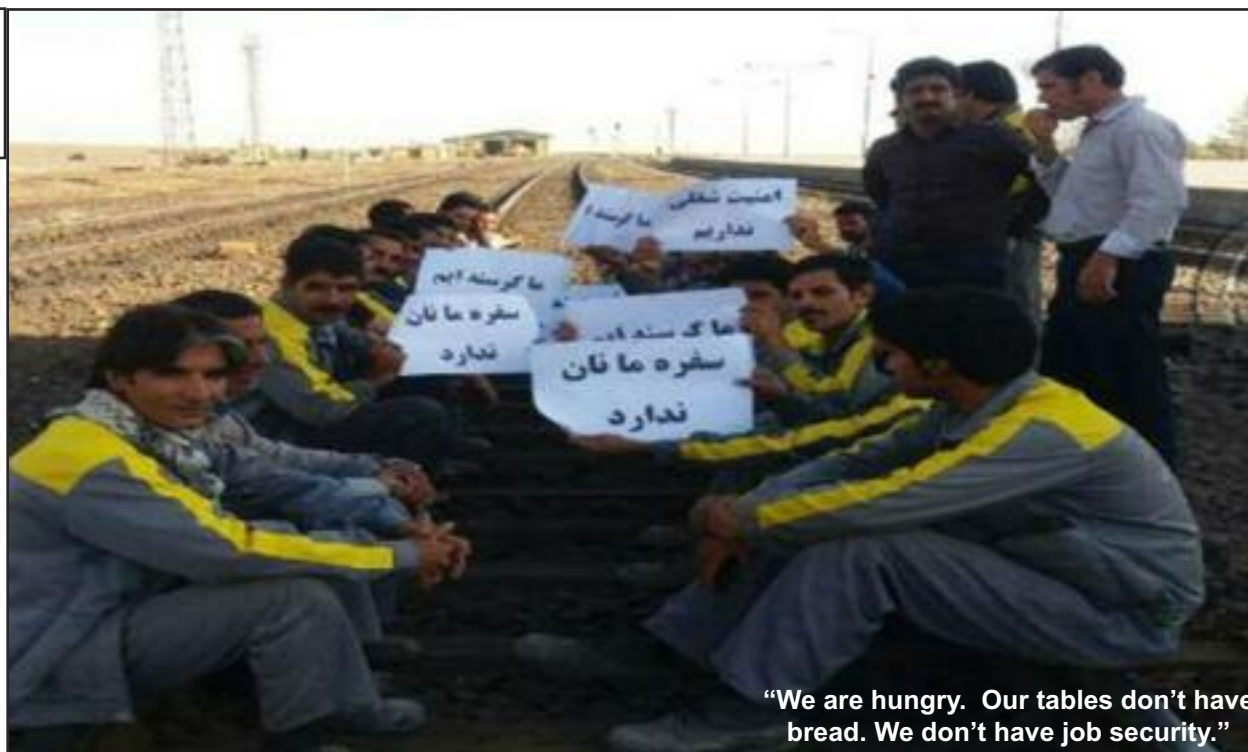
"We are hungry. Our tables don't have bread. We don't have job security."

September 19—As we go to press, strikes continue in Iran. Industrial workers and others have walked out in the face of the crisis of skyrocketing inflation and withholding of workers' pay. In some factories, workers haven't been paid for 12 months. The protests are a continuation of the uprising in December of the poor and unemployed.