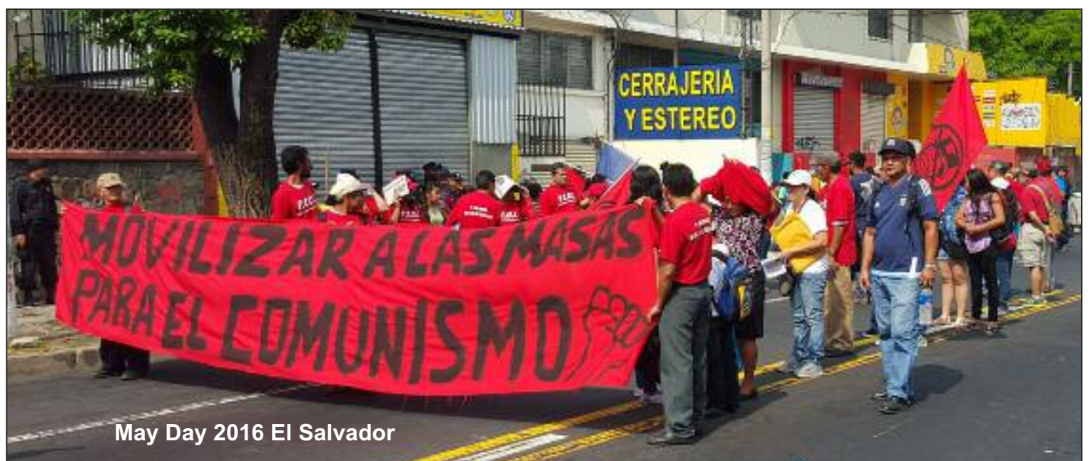
May Day 2016 El Salvador

In Communism there will be clean water for all, since the health of workers will be the priority. We believe it is necessary to continue the discussion about our main objective to mobilize the workers to communism.