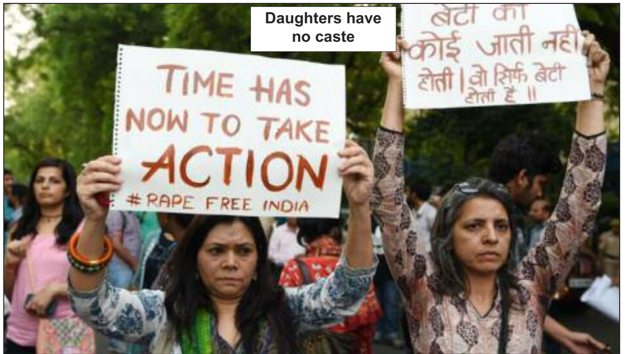
Indian demonstrators hold placards during a protest in support of rape victims, in New Delhi, April 15, 2018

As members of ICWP, after this evaluation on the action for clean water we had an informal meeting inside the factory. We made it clear to the workers that all of these kinds