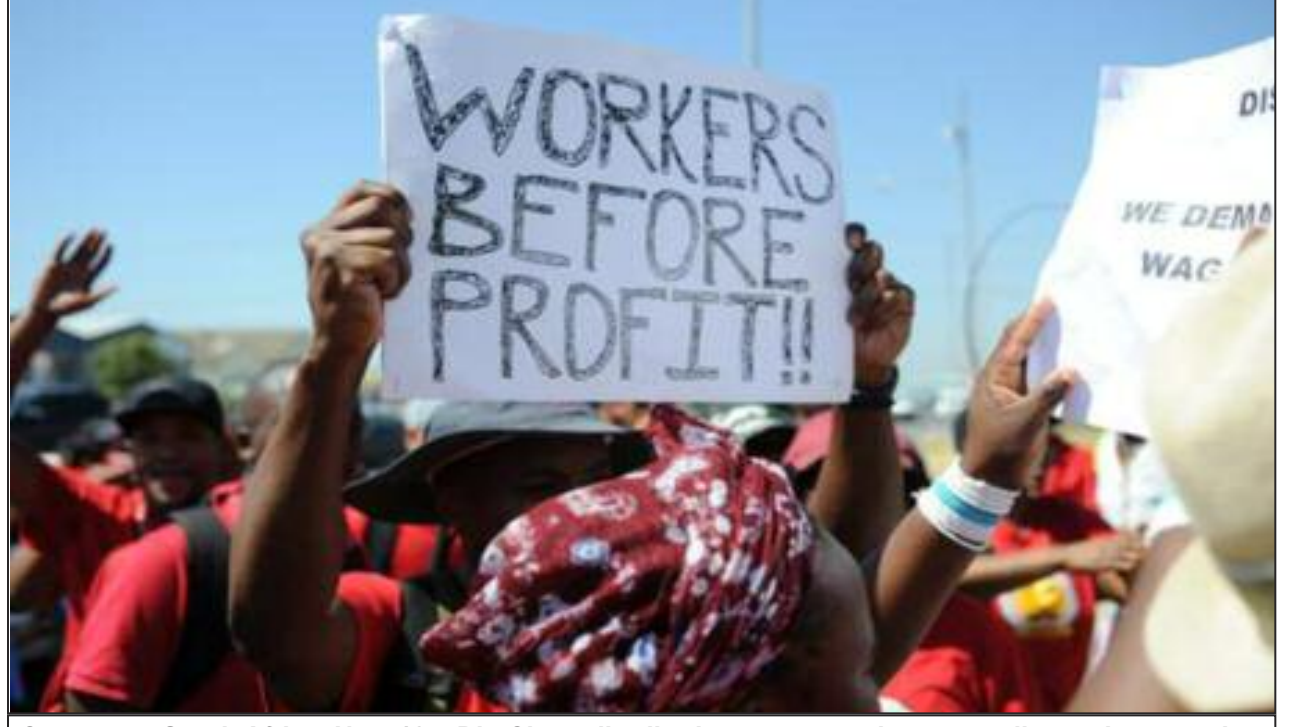
Capetown, South Africa, Nov. 18 – Dis-Chem distribution center workers on strike against a racist pharmaceutical company. In Johannesburg, police fired rubber bullets to disperse thousands of protesting strikers.

Certainly the imperialists' competition here in South Africa is full on and is being fought at the local level between various factions in the ruling party, the African National Congress (ANC), and between the ANC and the other opposition parties