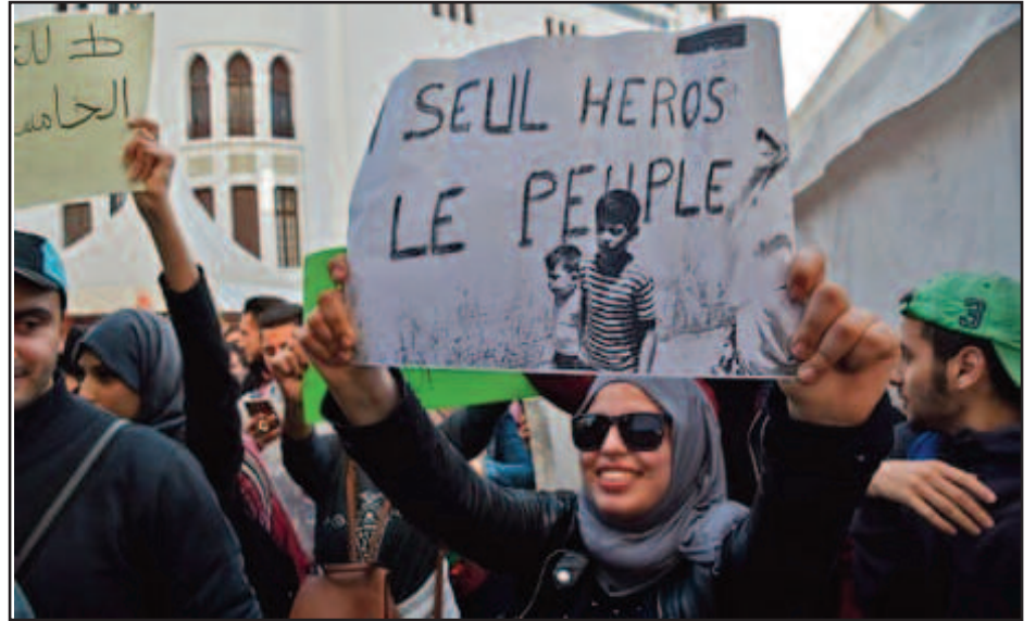
“The only heroes are the people”

ALGERIA: Escalating mass protests, including a five-day general strike, forced President Bouteflika to withdraw his bid for a 5th term. But they are not stopping there.