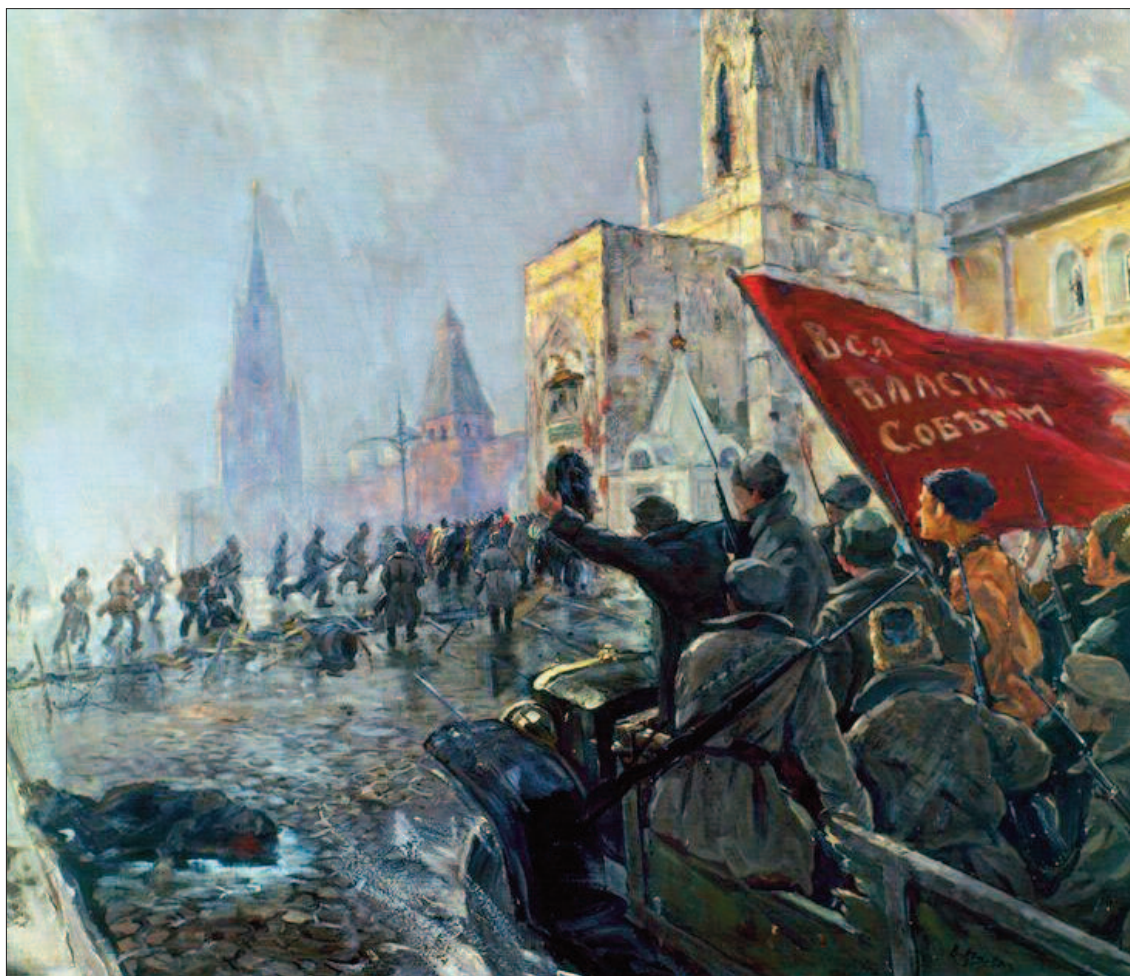
In 1916, during World War I and before the Russian revolution, the Bolsheviks attacked both the German imperialists and the Russian government. Many criticized the Bolsheviks, but 3 years later the Bolsheviks seized power with the support of workers and soldiers.

"I believe that the siege of Venezuela is a good opportunity to discuss how we (ICWP) would depend on the masses internationally to break that blockade," said a transport mechanic in