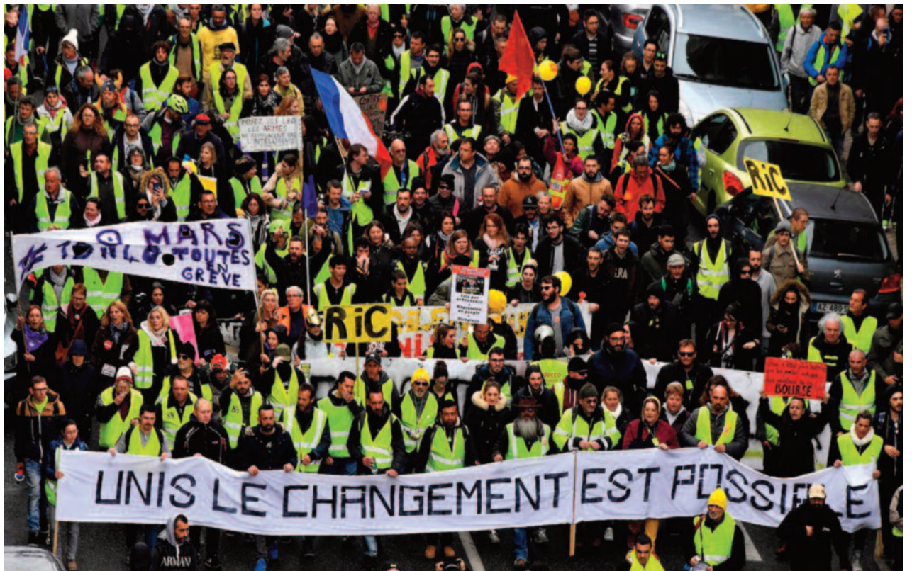
“United, Change is Possible”

But so powerful is capitalism’s ideological hold that even gilets jaunes rebels rarely consider communism. Instead there is constant pressure to get involved in electoral politics. This takes the