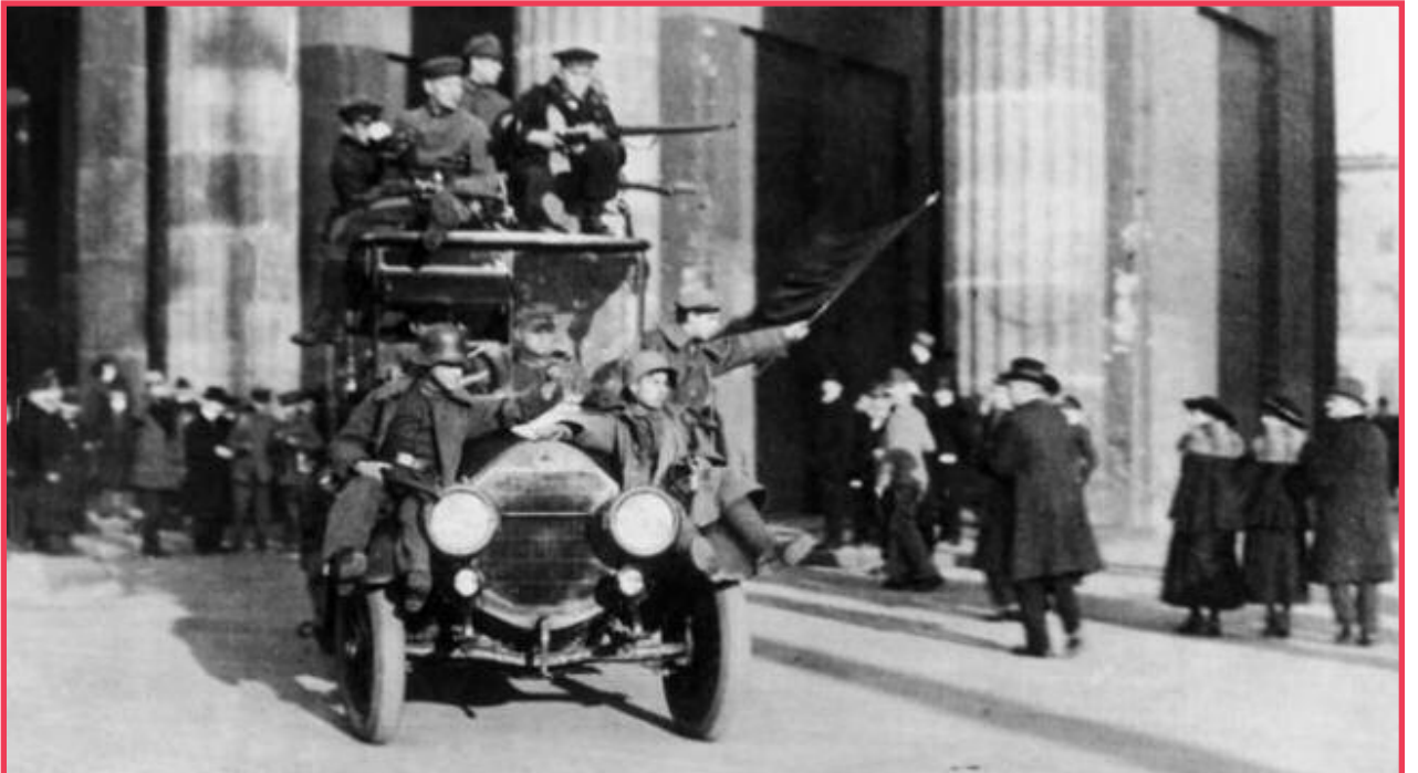
BERLIN, 1918-19: Red soldiers mobilize for revolution.

Leading US imperialists seem to believe this. Also in January, the US Senate Armed Services Committee described the new National Defense Strategy as “a fundamental shift in the orientation of our nation’s armed forces toward great power