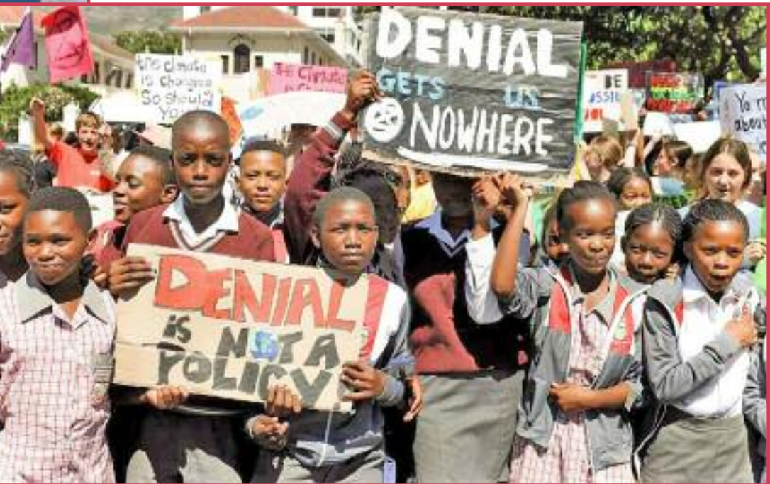
Above: Madrid, Spain; Right: Capetown, South Africa