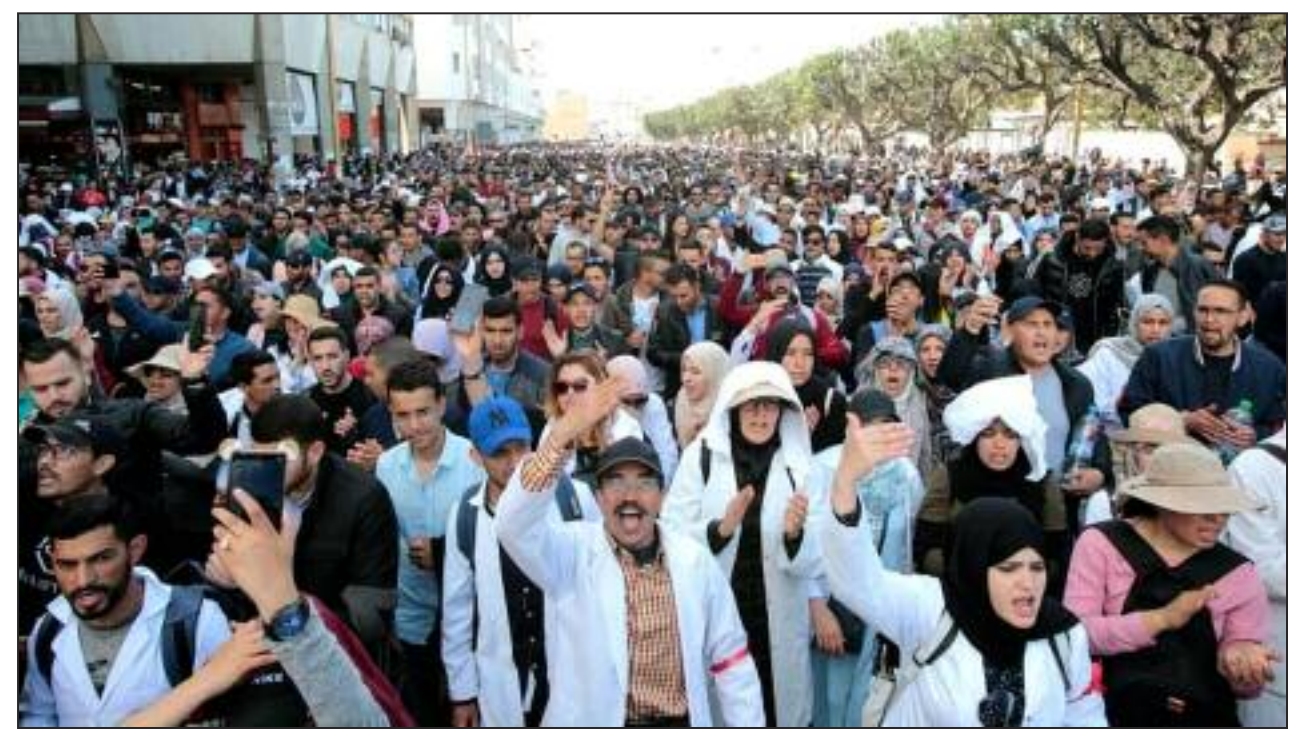
Striking Teachers in Rabat, Morocco, March 24, 2019

nate Morocco's trade. It also includes their US, Chinese and Arab competitors.