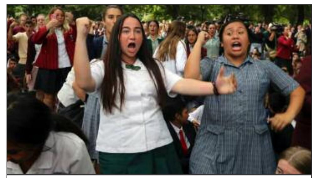
Students in Christchurch, New Zealand, perform a Haka, a traditional Maori war dance, in honor of the people murdered in the attack on the mosques on March 15, 2019.

That is why we decided as a collective to go and mobilize those teachers who