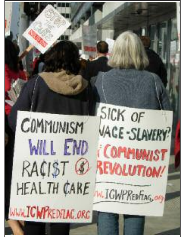
Kaiser strike, 2012

Getting to communism will come when most of us are committed to creating something different for our children and grandchildren. It will require a revolutionary fight, but a fight worthy of our collective efforts. We have a world to win.