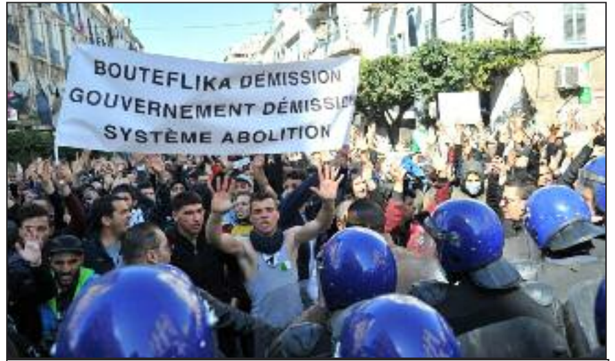
Marchers in Algeria demand that the government and the president be fired—and that the system be abolished

We don’t agree with some liberals who blame