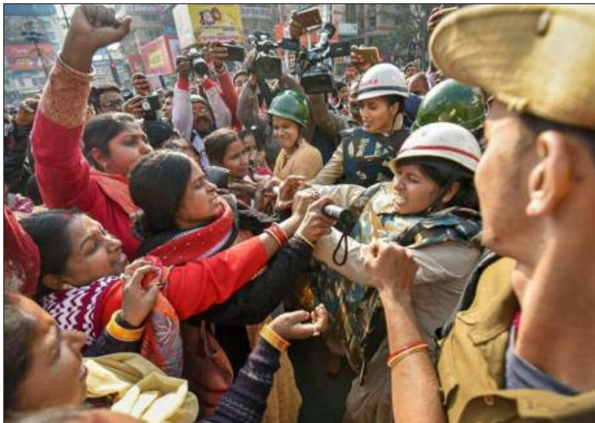
Workers fight police during a 48-hour India-wide general strike, January 2019.

There will be many opportunities for masses to take leadership in big ways and small. Developing communist leadership will be a top priority. Nobody will be elected or appointed to