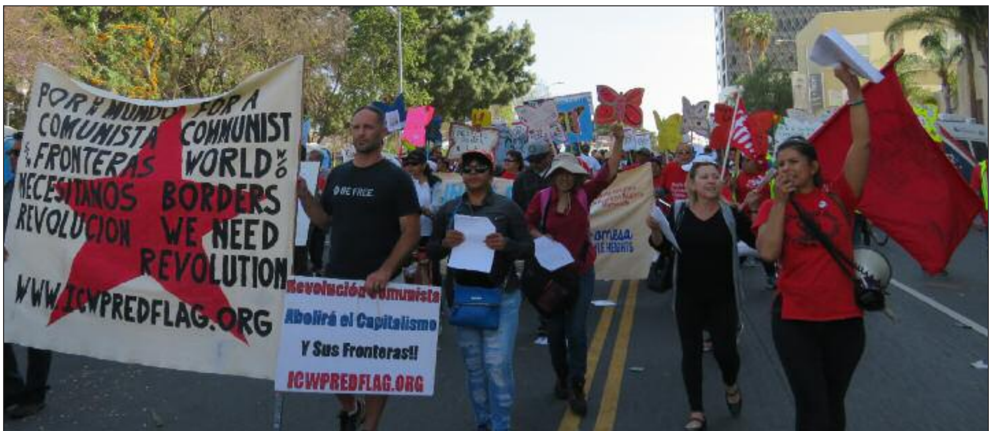
MAY DAY IN LOS ANGELES, USA

Finally, it is worth mentioning the participation of a friend of the party, a contact we made during the May Day March, Despite differences with the political line of the IWCP, he brought two women to the gathering who participated with songs and poetry and left us information about how to contact them. This very enthusiastic worker, eager to know more about the party, also asked us to bring our literature to the meetings they hold. And we have also promised to continue the efforts of friendship, and the struggle for them to join the fight for Communism.