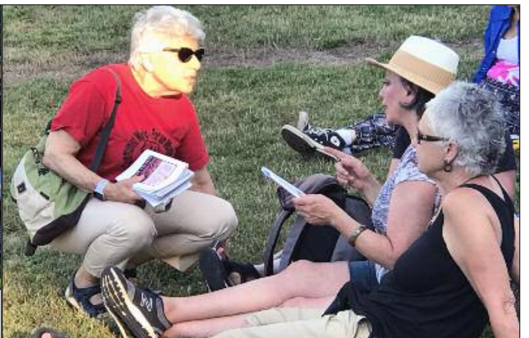
Seattle, WA (USA)