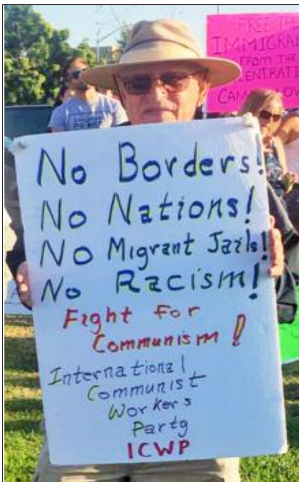
San Diego, CA (USA)

SEATTLE (US), July 12th—Comrades went to the neighborhood pro-immigrant vigil in Martin Luther King, Jr. Memorial Park this evening. This was one of scores of “Lights of Liberty” vigils across the USA and elsewhere that brought out tens of thousands of people outraged by the US government imprisonment of immigrants, especially children.