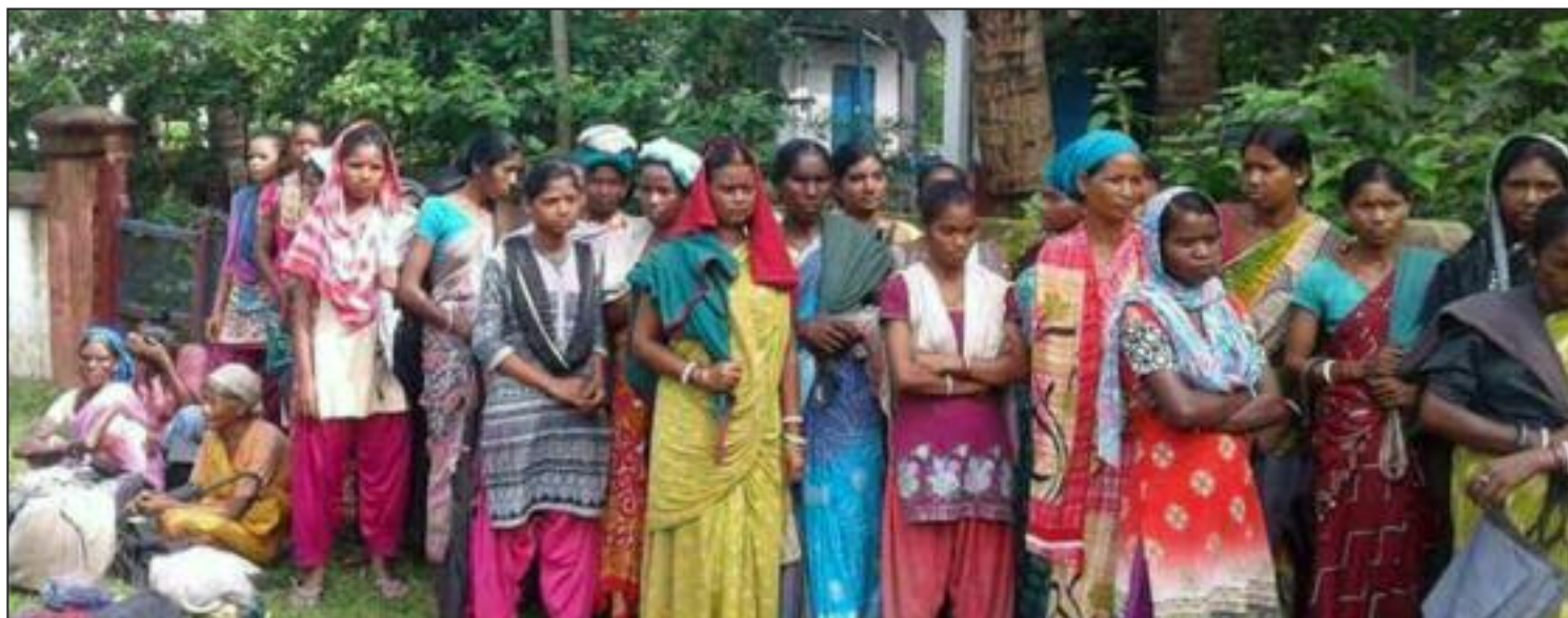
Hundreds of thousands of tea plantation workers in eastern India went on a three-day strike in August 2018. They demanded an increase in daily pay from 169 rupees ($2.46) to 203 rupees ($2.96). ICWP is organizing to mobilize tea plantation workers to fight for communism and an end to the wage system.

We have to sharply struggle with one another in a comradely way to overcome obstacles we face in building our party. We are learning to solve the contradictions to move forward. Our communist school wants to prepare plans for billions of us to end the rule of the billionaires of the world.