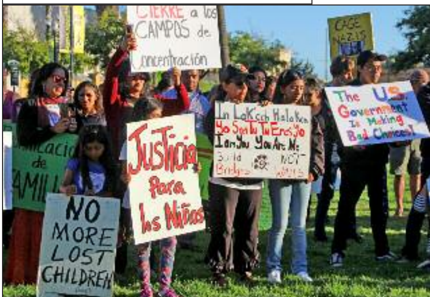
Watsonville, CA (USA), July 12 – A comrade and a friend discussed what they would do at the “Lights for Liberty” vigil. They took communist literature to make contacts for ICWP. The next day, they called every one of the six people they'd met to make plans to get together.

Capitalism separates us. Parents bear almost the whole responsibility for the well-being of their children. It's easy to blame parents for the horror that capitalism visits upon working-class children, especially those from another nation or “race.” Compassion (however well-meaning) is a poor substitute for communist solidarity. We will continue these discussions in the weeks ahead with friends at work and school and with those we met Friday. We ask our readers to help us out with your ideas.