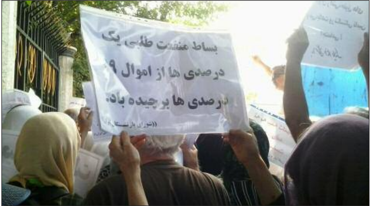
July 17, 2019 – A wave of mass protests continues to roll across Iran. So far this month these included bus drivers, street vendors, literacy teachers, municipal workers, and many more. Workers went on strike against the Mahtab-Sair-Jam Company, builders of recreational wagons. They protested the layoff of 57 co-workers with 15-20 years on the job. Bahai senior citizens have protested government attempts to shut down their Elder Care Center in Karaj. More and more women are walking openly around Tehran without the government-mandated headscarf. Pictured above: Retired government employees and military personnel outside the labor ministry in Tehran, defying a heavy police presence. Among the banners were: “Our homes have been plundered, we have no fear to expose [the government], we will stand till the end.” “The one percent are making profits out of the pockets of the 99 percent.”

Some US rulers are bent on regime change in Iran, either internally or through war. They want a regime that will side with them like the Shah did 40 years ago. They are willing to go to war to re-conquer the whole oil-rich Middle East.