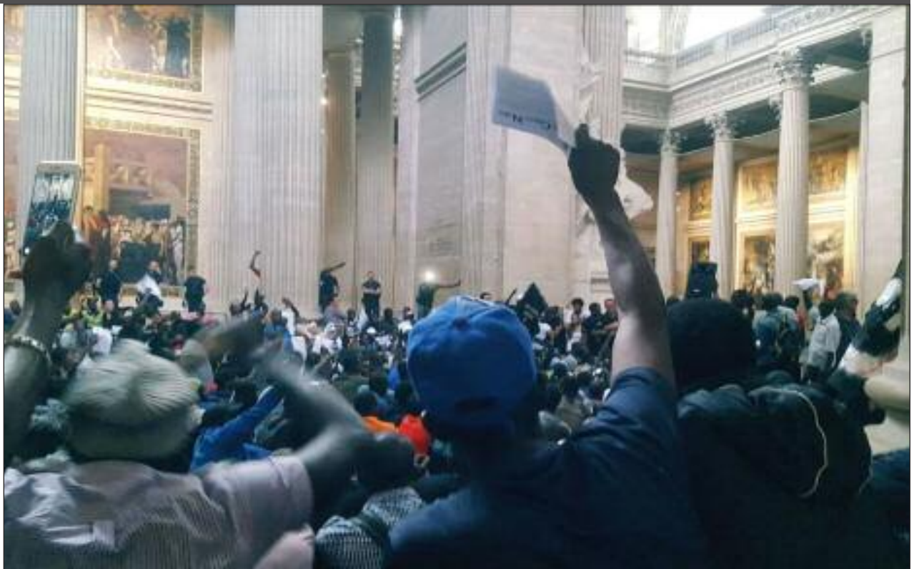
July 12—Hundreds of undocumented African immigrants known as Gilets Noirs (Black Vests) occupied the Pantheon in Paris, demanding legal papers, jobs, housing, and an end to police attacks. They denounced the system which colonized their home countries and forces them to emigrate. Their chosen spot? Beneath a statue representing France reading: “live free or die.”

I feel like women must go an extra mile to prove that we can do what males can do.