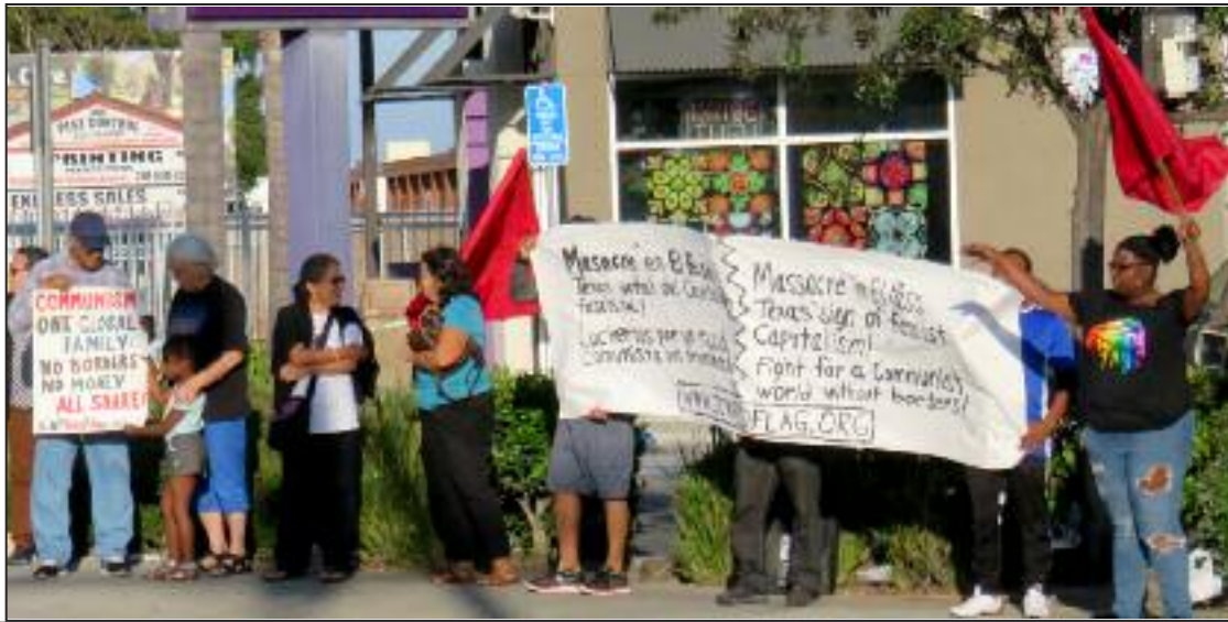
VOL. 10 #11, August 28 to September 18, 2019

Several people we had invited to the forum and the protest were there waiting for us—more interested in taking action than in discussion. And on a corner with very little foot traffic, a woman came up to us, took a video of our signs to post on social media, and gave her name and number to be contacted for our next event.