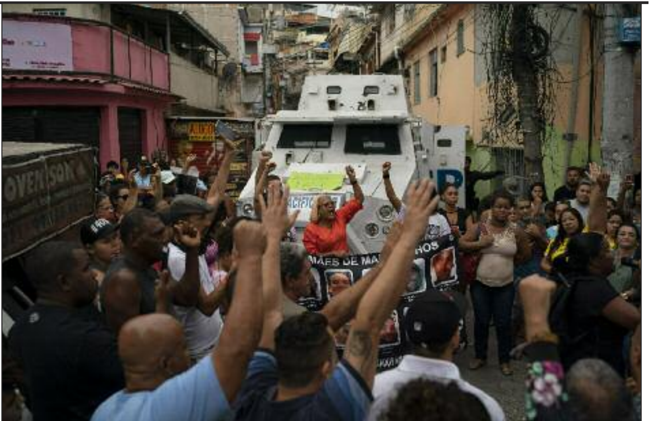
RIO DE JANEIRO, BRAZIL, September 21, 2019—Protest against police murder of Agatha Felix and other children in the favelas.

The bosses are increasingly resorting to fascism everywhere because of weakness, not strength. The rise of fascism is an obstacle but also a potentially huge opportunity for us to recruit masses for communism. We will continue to address this contradiction in the months leading up to our communist conferences next year.