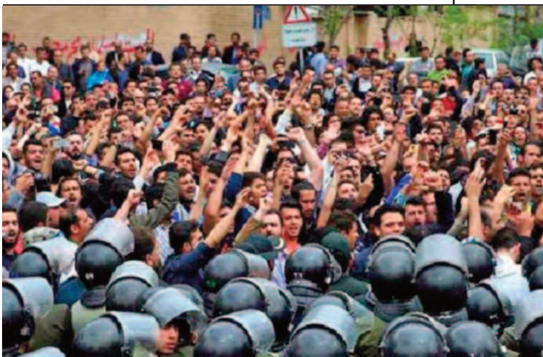
Gas Price Protest, Iran, November 2019

Join and build the International Communist Workers' Party