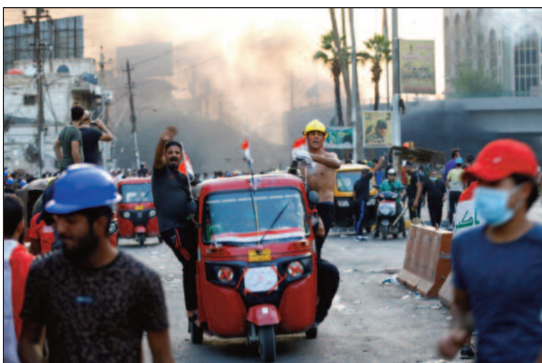
Baghdad Tahrir Square Protest, October 2019

In Baghdad, these protests have centered in Tahrir Square. They have developed into a