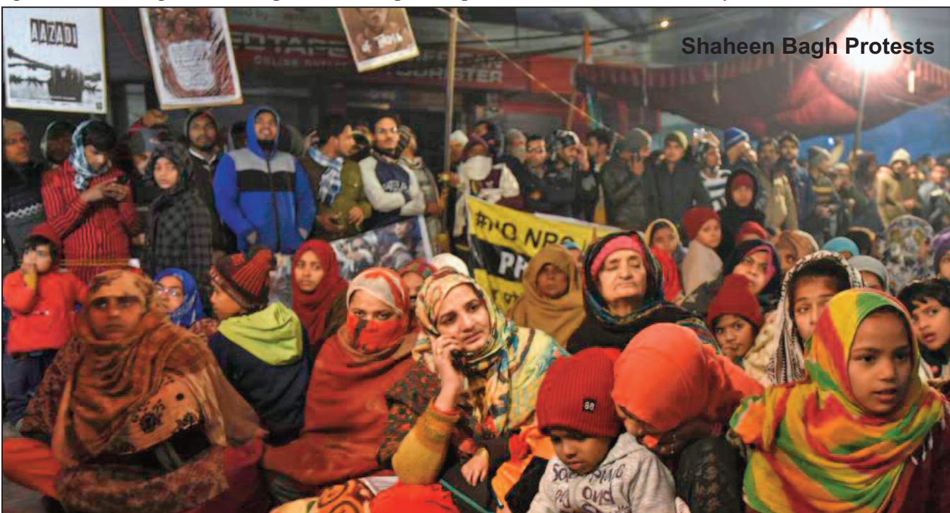
Shaheen Bagh Protests

Masses in India are yearning for communism. Our comrades are mobilizing for it amidst the street protests. We are building our communist collectives into the nucleus of a mass ICWP and the red army that we need to destroy capitalism.