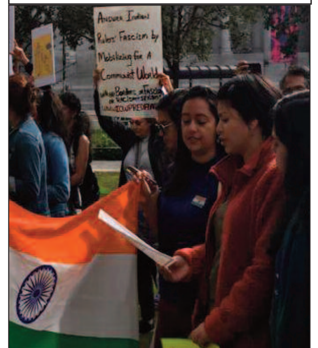
Los Angeles (USA) December 21— Comrades bring communist ideas to protest against India’s fascist Islamophobic laws

—University students in Mexico organized in the International Communist Workers’ Party