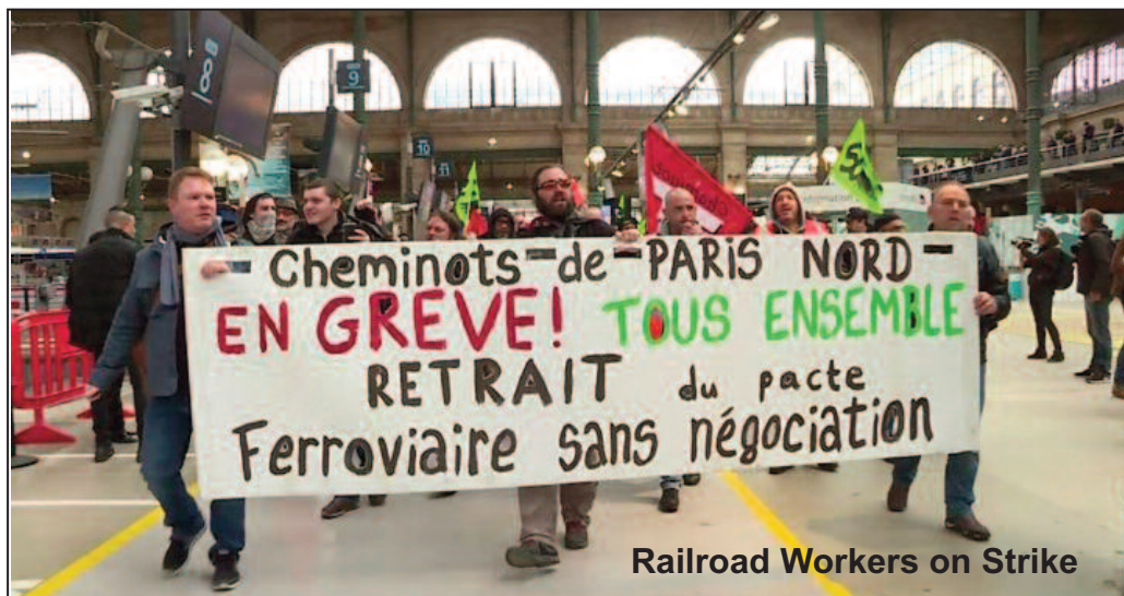
Railroad Workers on Strike