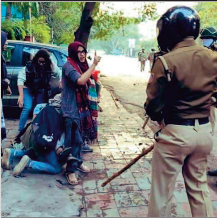
Muslim female Jamia Milia students shielding a male student from police