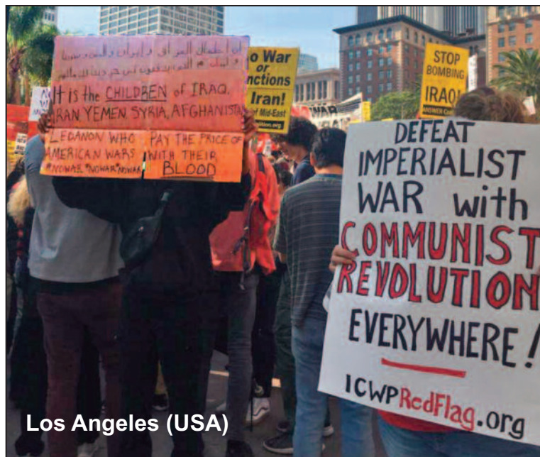
Los Angeles (USA)

Iran, Russia and China completed another joint naval training exercise in the Gulf of Oman on December 31. This illustrates the new reality. It shows that the US cannot isolate Iran and that Russia and China are ascendant in the region. So, too, does Iran's January 5 announcement that it will renew its development of nuclear capacity.