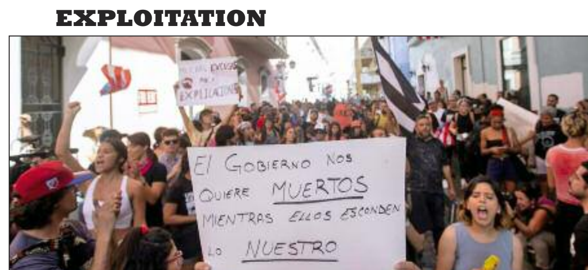
San Juan, PR: The government wants us dead while they hide what is ours!

About 150,000 people in Puerto Rico have lost their homes, which were repossessed by the Banks. There are fewer quality health services, deteriorating the physical and mental health of