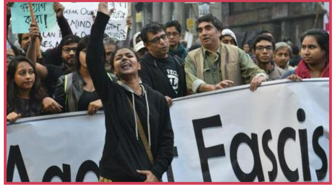
January 8, 2020—General Strike in India

We can write a book filled with stories of workers who are so angry and desperate that a communist alternative brings hope, determination and direction to building our party. Even our 10 and 12 year old children, traveling with us, understood communist politics. They often interacted with passengers to explain why capitalism needs to go. Eleven comrades met us at the Chennai train station. Although we were meeting for the first time, our common bond of communist revolution made us feel as if we had known each other for a long time. It took two hours for us to reach their homes, where we had a delicious dinner. We overcame the language barriers and started talking seriously about building the party. Comrades felt that as the crisis of capitalism is deepening, workers can either join the communist path of ICWP or the nationalist/fascist path of keeping capitalism alive with a bloodbath. Our leadership in this struggle for communism is crucial. Reforms to fight for job security, pension plans, health and housing benefits attract many workers to join and fight for unions and political