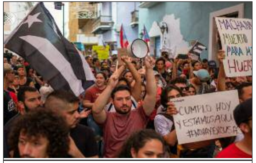
San Juan, Puerto Rico, January 2020

Public education is increasingly deteriorating, aggravated by closing hundreds of public schools