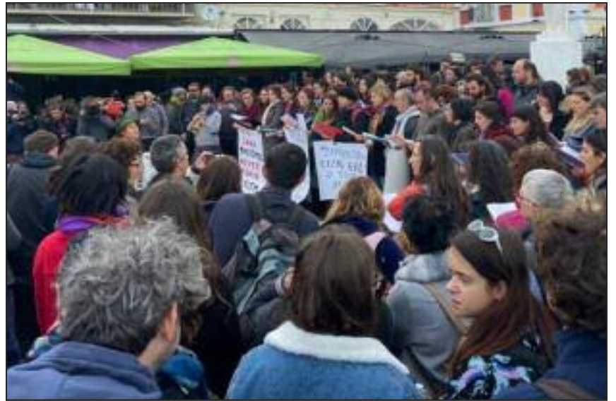
March 7, Rally in support of refugees in Sappho Square in Mytilene, Lesbos, with signs saying "Never Again"

No boss—from the US, Russia, Turkey, Syria or the European Union—gives a damn about the lives of our class. The response of the anti-fascist masses in Europe has within it the seeds of the movement that we need. But to create a world where no worker will be considered a foreigner, we must go beyond fist fights with fascists and marches in the streets. We must build the forces necessary to fight for a communist world—no bosses, no borders! Workers of the world unite!