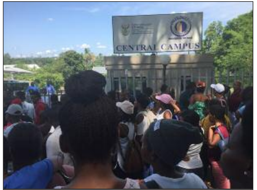
South Africa -- Technical College students protest withholding of much-needed financial aid

I told him that these are good ideas that we are discussing inside the party, whether we should wage class struggle while at the very same time advocating for communist revolution. I think we need to consider these things more, moving forward as a collective in South Africa, because these are the cries of the working class. They don't see any alternative. He sees us as an alternative to these reformist parties, because they know that they have been sold out many times by