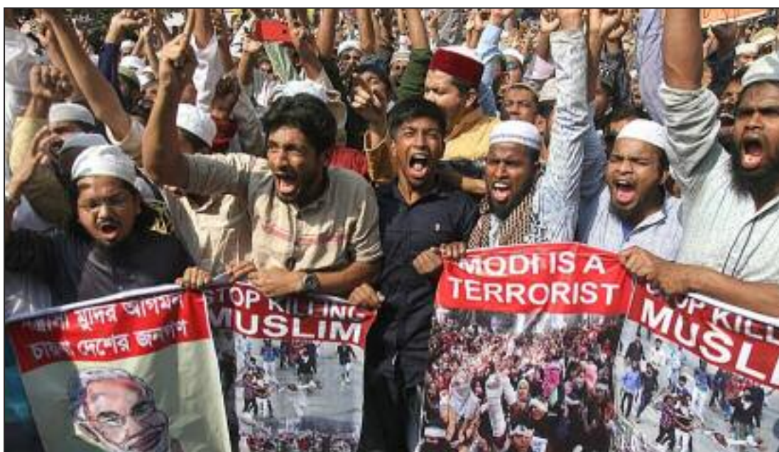
Protestors in Bangladesh denounce Indian Prime Minister as a terrorist