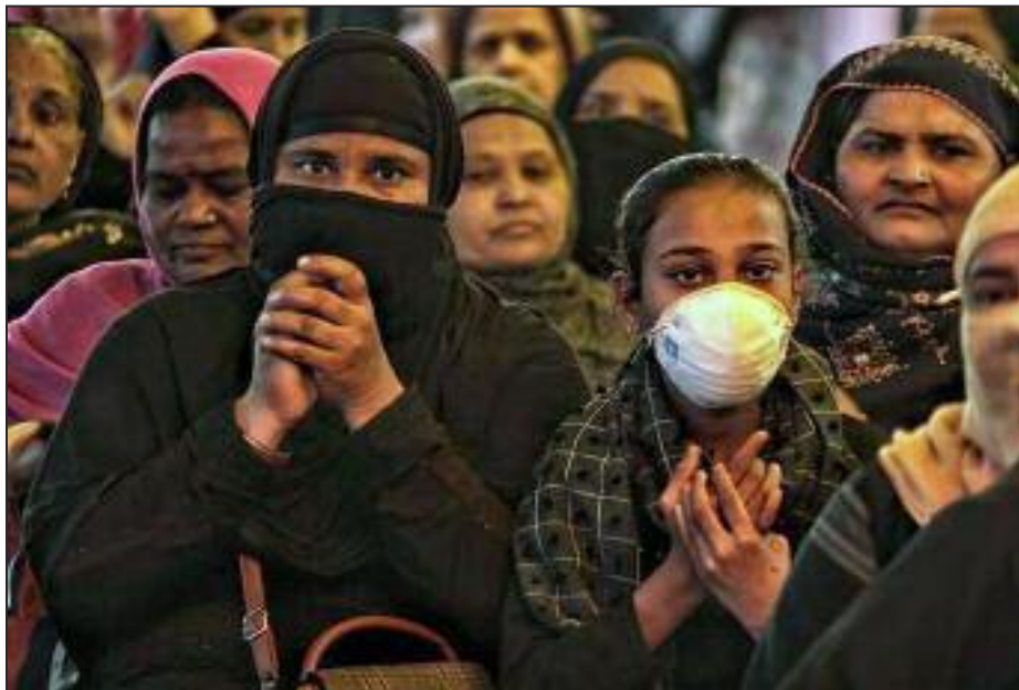
India: Women of Shaheen Bagh take precautions while protesting Modi's fascist citizenship laws.

We met as collective many times. In India, almost 80% of the workers are wage slaves on an informal, day labor basis. In India there are about 300 reported cases of coronavirus. But the complete shutdown of the cities have left literally hundreds of millions without any means to survive. Before people die from the coronavirus related illnesses, the masses are left to starve to