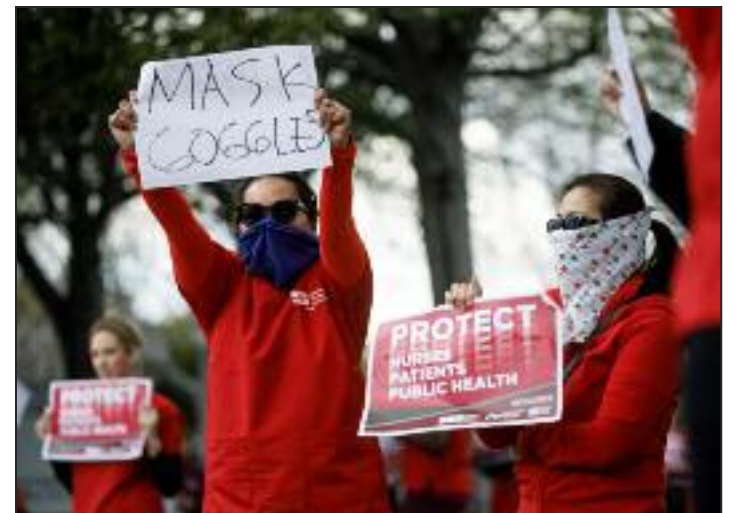
Nurses at Kaiser in Fremont CA (USA) demand personal protective equipment

In communism, there would be continual mass production of medical supplies, drugs and treatments. We will have redundant capacity, including training workers how to make necessary medical supplies in all kinds of factories. We will mobilize masses to prepare (and train) for any health crisis.