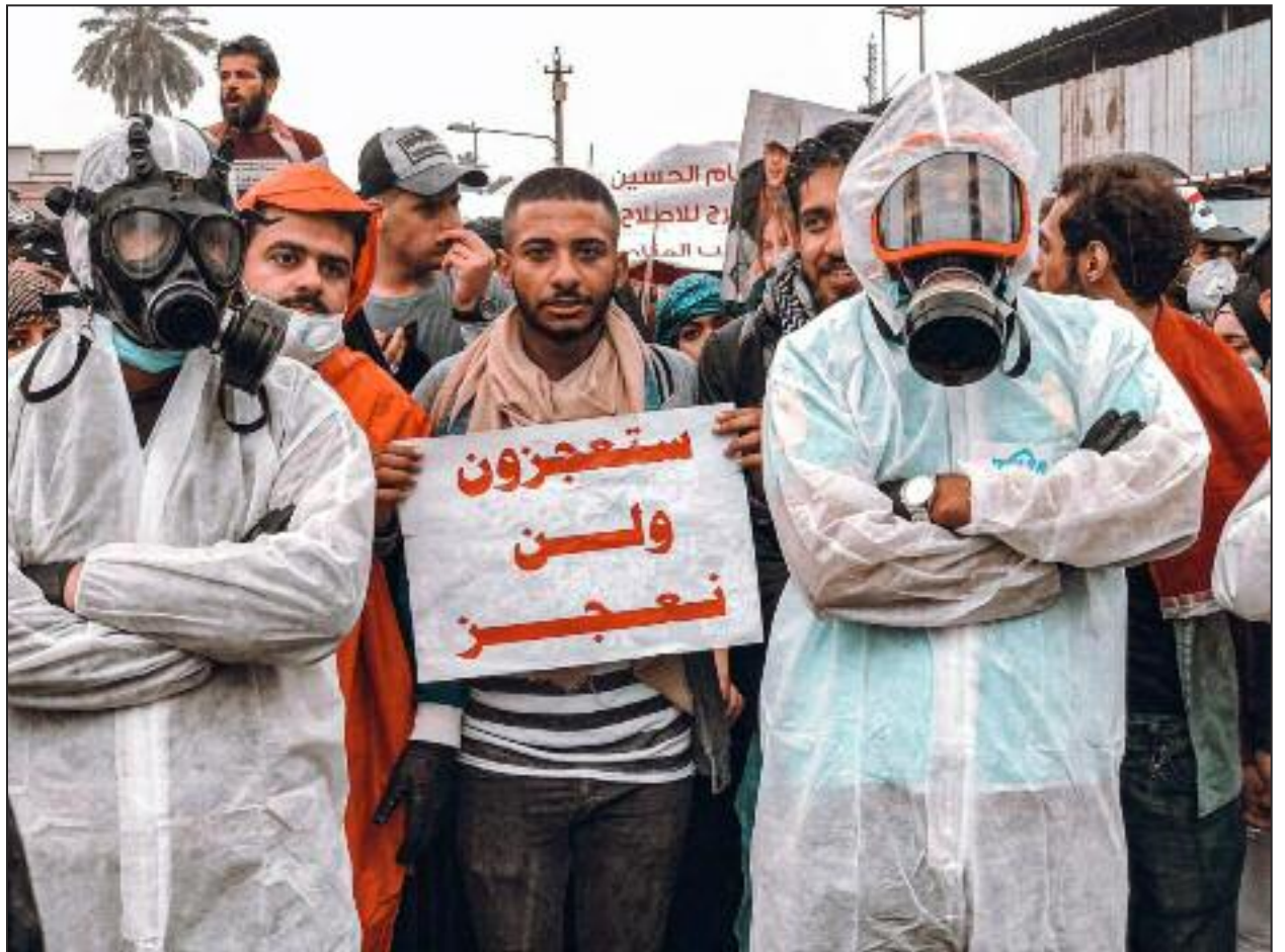
Baghdad, Iraq – Protesters carry banners reading: "The people want to overthrow the regime." One declared that "the government and its militias are more dangerous than a virus."

I decided to contact my friends in the military and I started to talk about this. For them, at