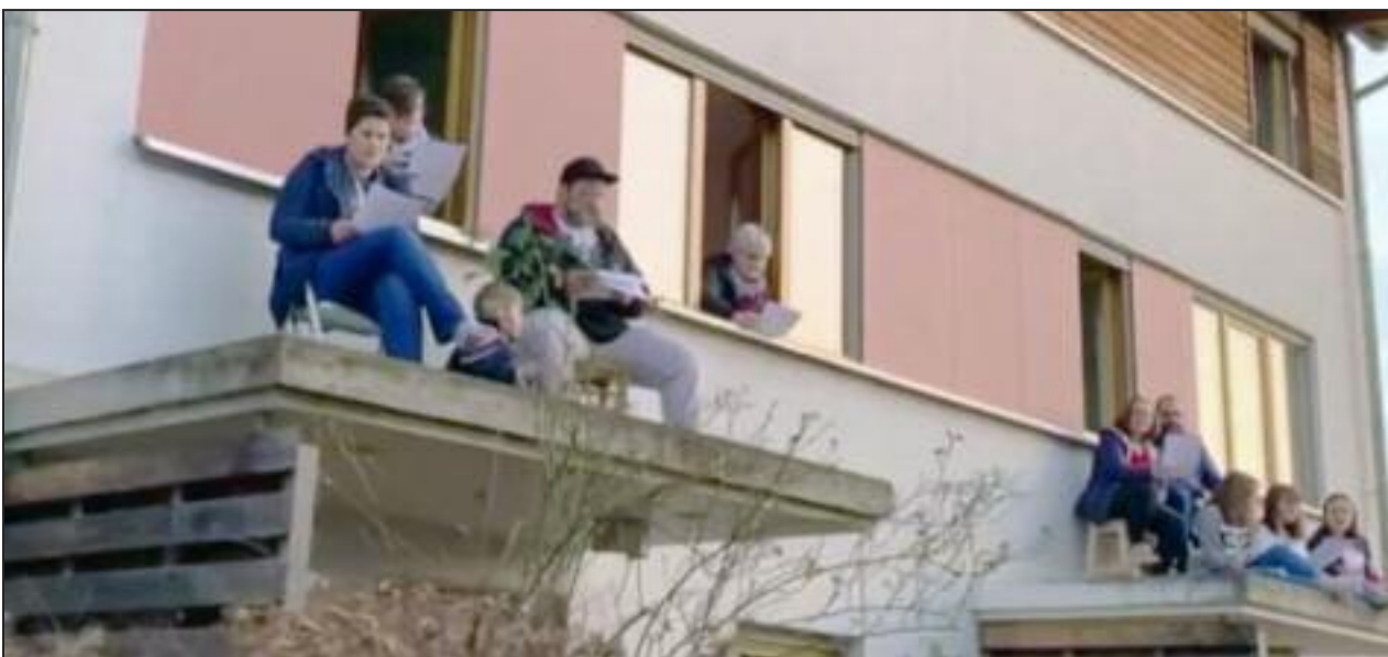
Germany: Neighbors sing "Bella Ciao" in solidarity with quarantined Italian masses.