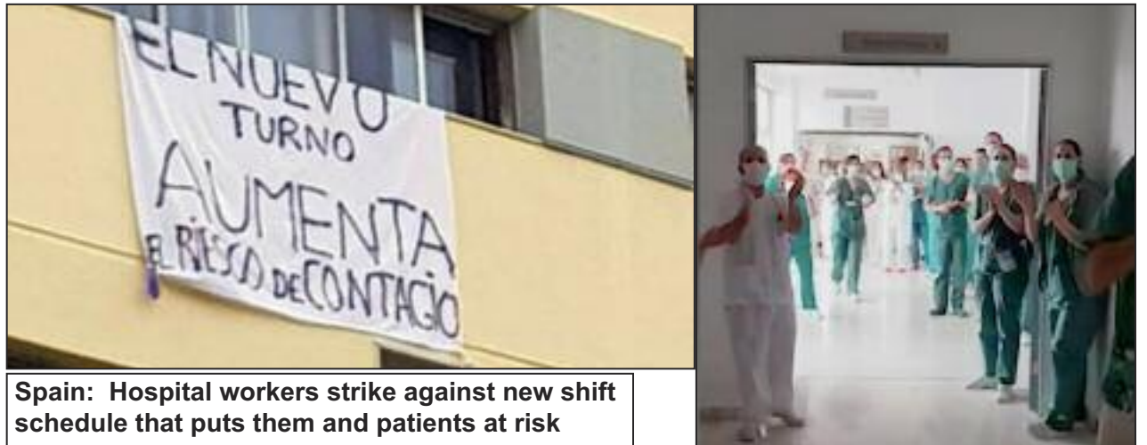
Spain: Hospital workers strike against new shift schedule that puts them and patients at risk

Join ICWP! That's how we can avoid disasters like the one we are living in today.