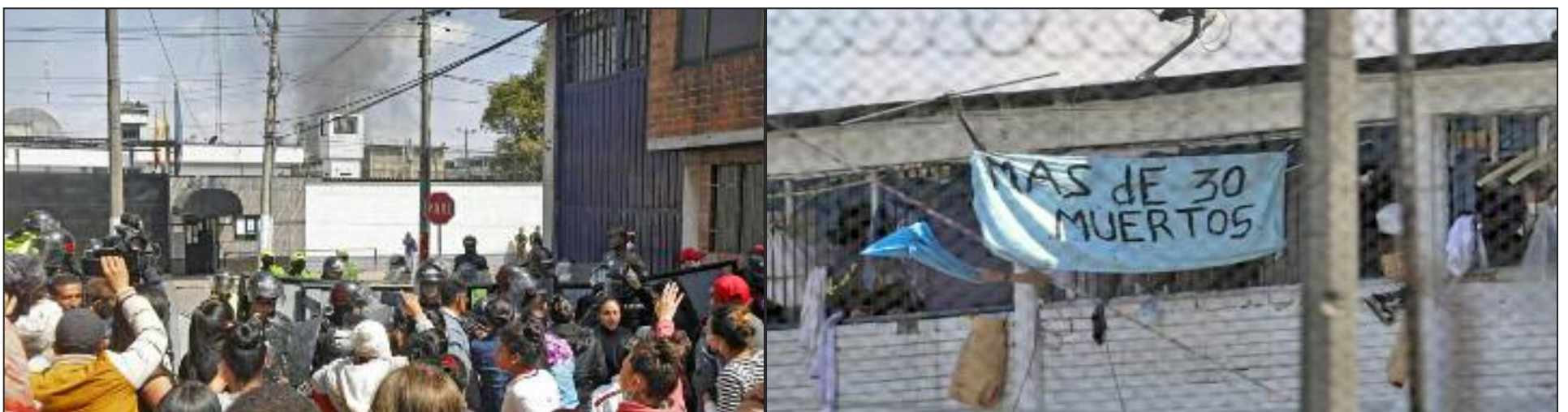
Colombia – Prisoners rebel after COVID-19 kills more than thirty in Bogota’s Modelo prison.