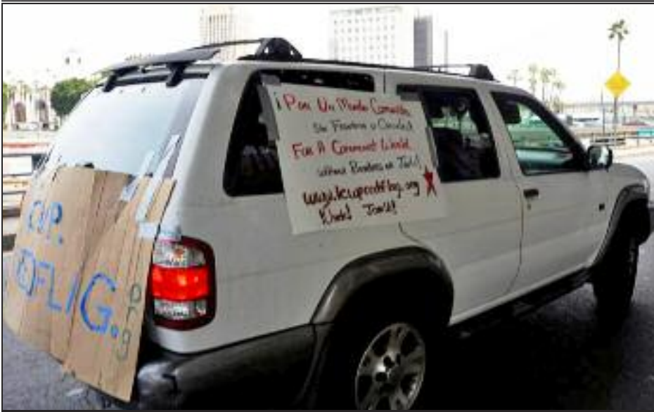
March 31—Comrades in Los Angeles take communism to car caravan at immigration jail demanding that all detainees be released.

PLEASE SEND US YOUR LETTERS, RESPONSES AND SUGGESTIONS TO ICWPREDFLAG@ANONYMOUSSPEECH.ORG