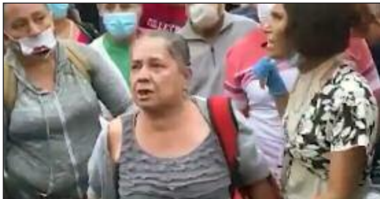
In El Salvador, thousands gathered outside a government building in the capital San Salvador Monday to demand the $300 government checks President Nayib Bukele promised to some 1.5 million households who work as street vendors and other jobs in the informal economy. El Salvador has been on a nationwide lockdown for nearly two weeks.

The privatization of health care worldwide has caused the health care system to collapse. In Communism, the ICWP will prioritize humanity. Its health will not be a source of profit. This