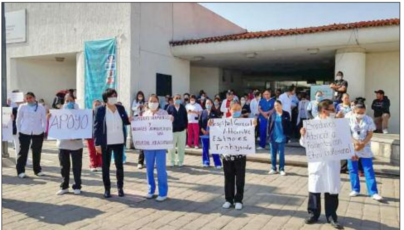
March 30—Workers at the General Hospital of Atlacomulco, in the State of Mexico, protest bad conditions and lack of personal protective equipment.

They have already changed the boundaries of political debate. It is out of this struggle that the future leaders of our communist revolution will come!