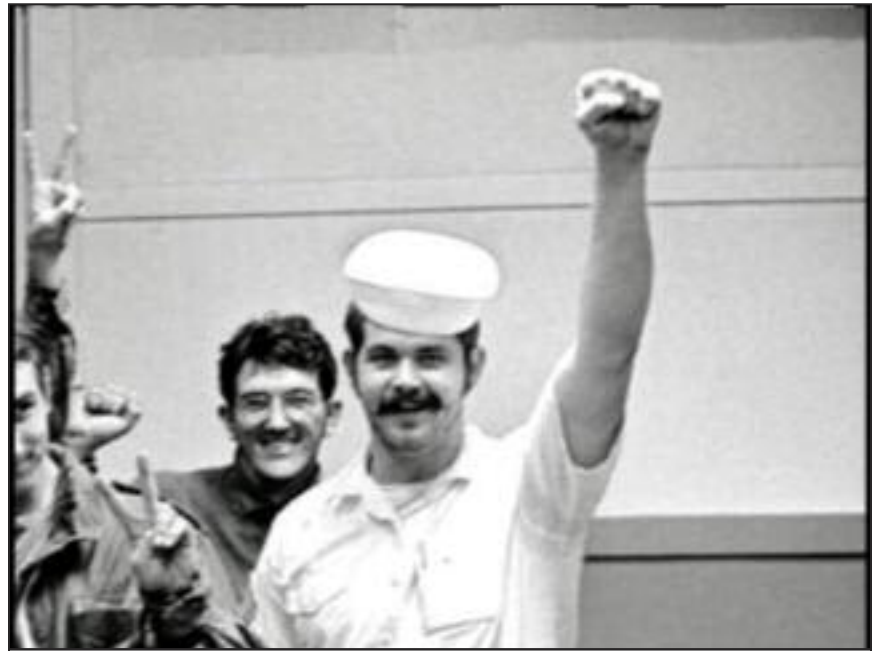
American sailors and soldiers were active in the fight against the US war in Vietnam—from the video Sir! No Sir!