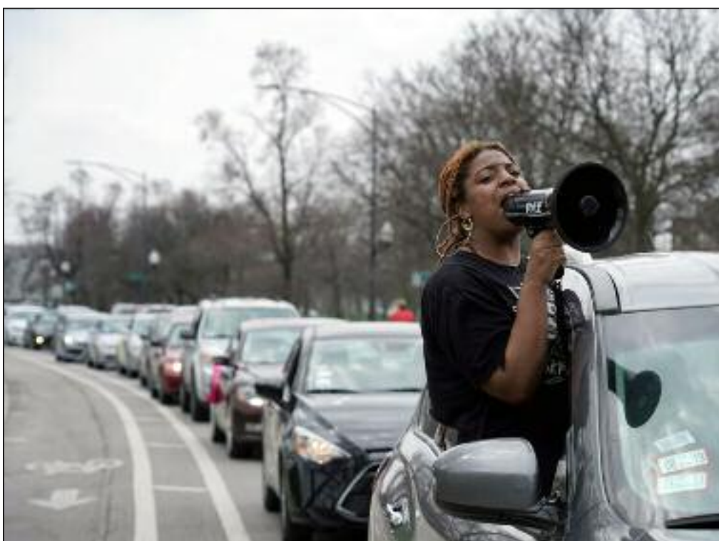
CHICAGO, USA, April 7 – Solidarity Caravan circles Cook County Jail, site of the largest outbreak of Covid-19 in the US so far, calling for the mass release of detainees.