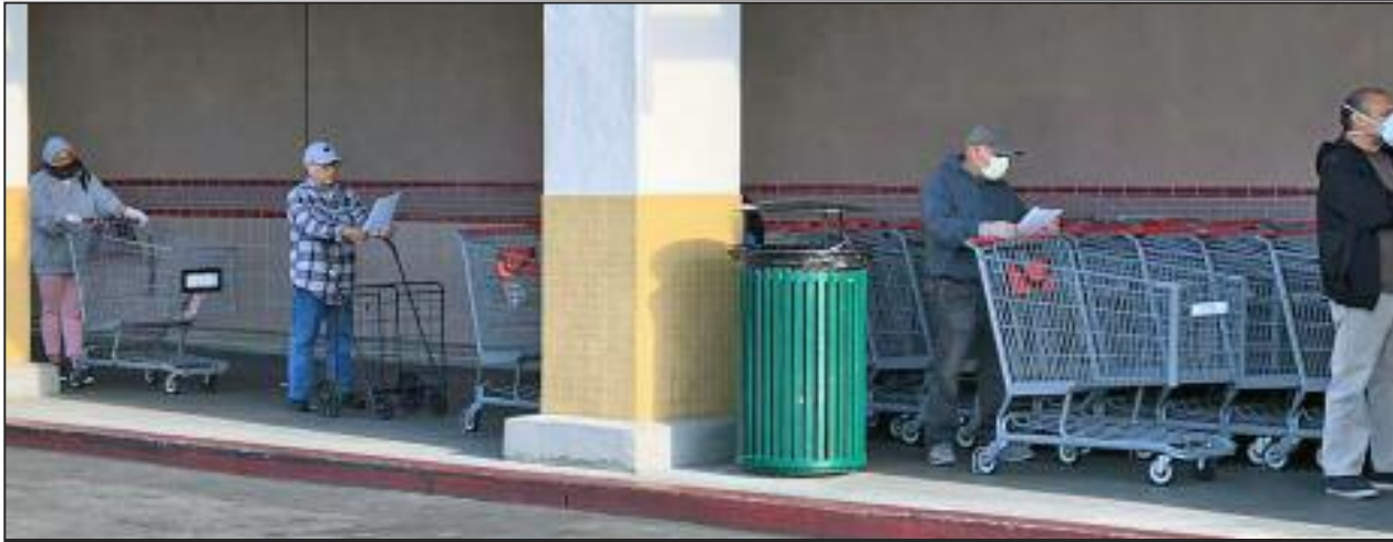
LOS ANGELES (USA) —Early morning shoppers read ICWP leaflet about Covid-19 and Capitalism. Comrades have twice gone out to grocery stores to put leaflets on car windshields.

PLEASE SEND US YOUR LETTERS, RESPONSES AND SUGGESTIONS TO ICWPREDFLAG@ANONYMOUSSPEECH.ORG