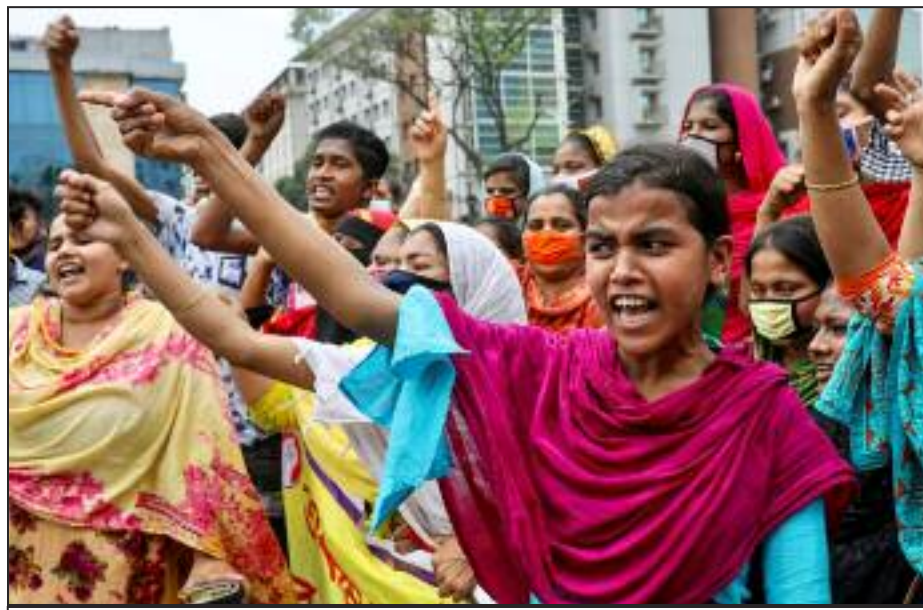
Bangladesh, April 15, 2020—Garment workers demand wages

We are organizing worldwide, through our Red Flag newspaper. We have comrades in India