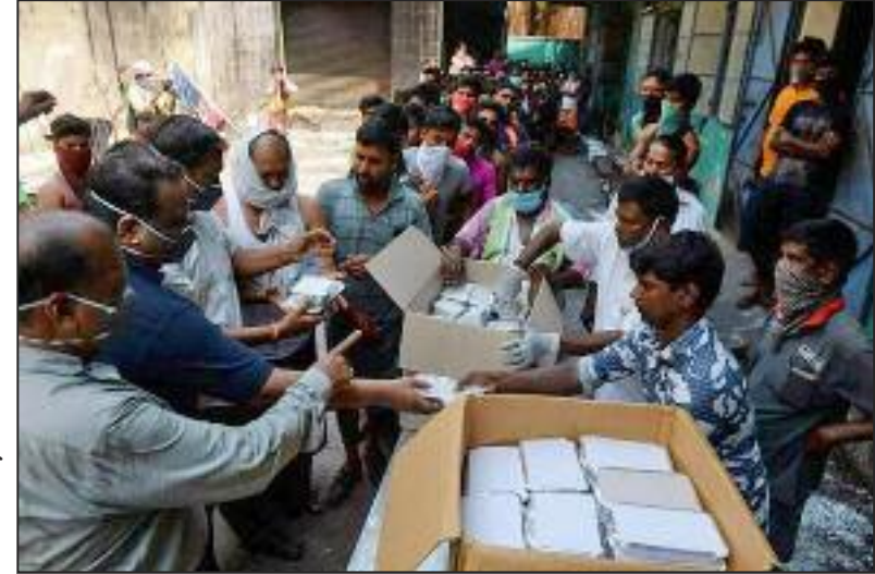
Volunteers feeding the masses in India.

tives in India are organizing for a weekend in June when all our comrades will participate in lively discussions to build our communist future.