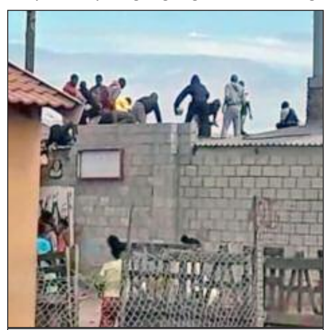
CAPE TOWN, April 19 — Hungry South African workers defy lockdown, loot shops that sell mainly food. Soldiers have shut down the whole area, killing at least one person.

The government supposedly has a plan for everyone: they are going to give small and large