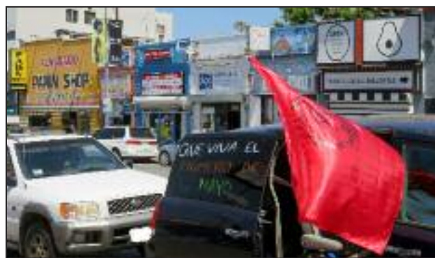
More photos of the May Day Car Caravan in Los Angeles