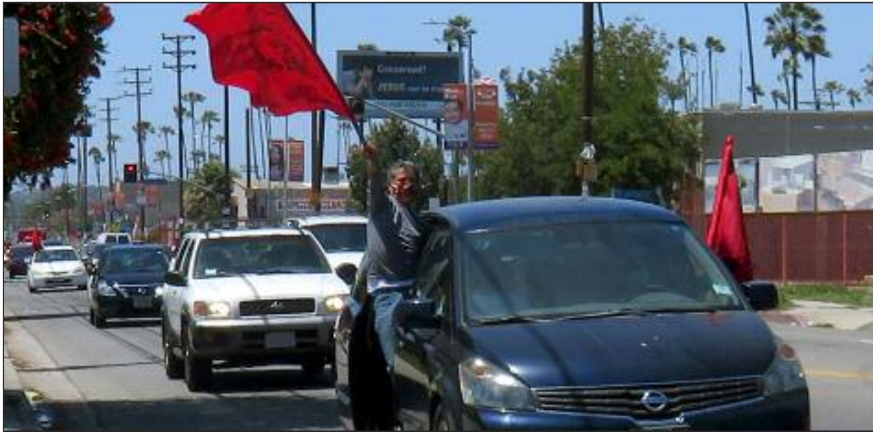
May Day, Los Angeles, USA

This May Day virtual rally is to strengthen our fight and grow a communist party that will win the communist world we need. Let's begin now!