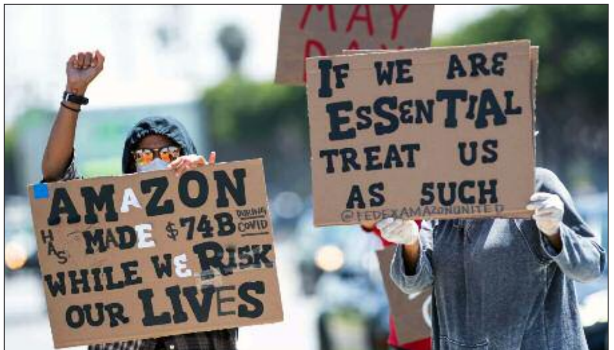
Hawthorne, California -- Warehouse and delivery workers across the US strike on May 1 to publicize demands for protective gear, extended sick time, and higher pay at a time when companies like Amazon, Fedex, InstaCart and Target are making record profits.