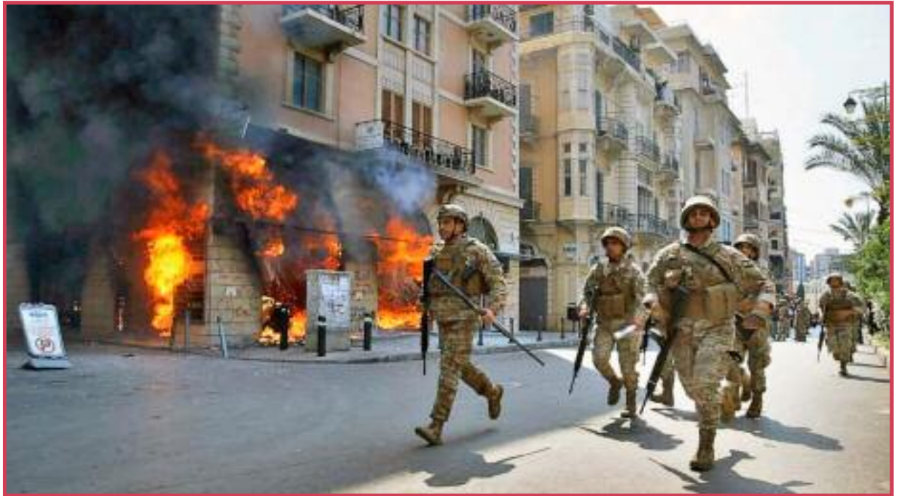
"Hunger Revolution" in Tripoli, Lebanon , April 27-29: Workers and youth defy security forces, burn banks, march on politicians' residences.