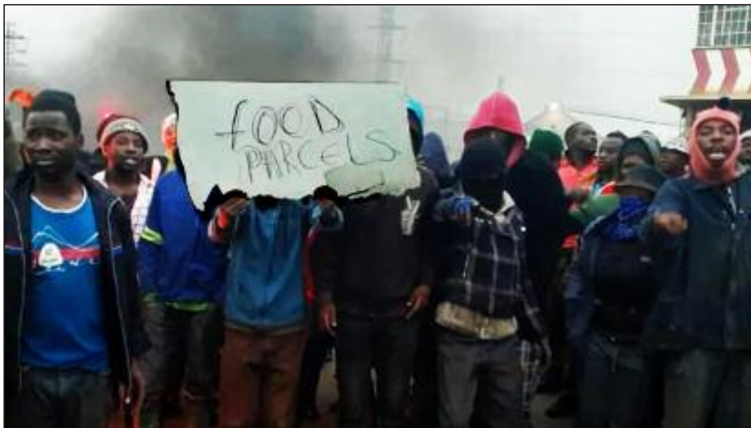
Nigerian workers in Johannesburg, South Africa demand the food parcels that had been promised during the 21-day COVID-19 lockdown.

Our main task is to mobilize the masses for communism in the whole country, not just in Port Elizabeth. Now it is about time for us to take this next step, to seize on the opportunities that are created by the virus. The virus is a bad thing, but it has given us the opportunity to recruit workers who are disgruntled with the bosses into our cause.