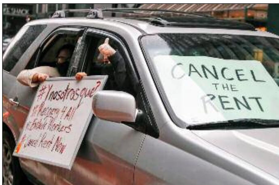
New York City, May 1: Rent strikes and protests hit major US cities, demanding the cancellation of rent and mortgage payments.

The real disease is capitalism and the working class anywhere in the world must be united and vigilant to combat it. The fight for a communist world, free of exploitation, with access to health for all, is more necessary today than ever. The working class has no borders! Long live International Workers’ Day!