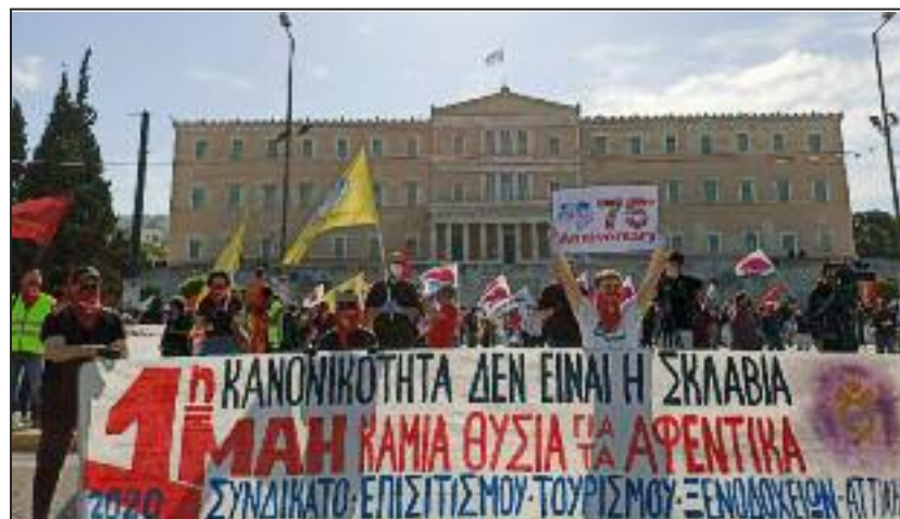
May Day in Athens, Greece: "Capitalism Is the Deadliest Virus"

History is on our side. With a massive International Communist Workers' Party mobilizing the world's masses for communism and nothing less, our victory is inevitable. We will build a communist world!