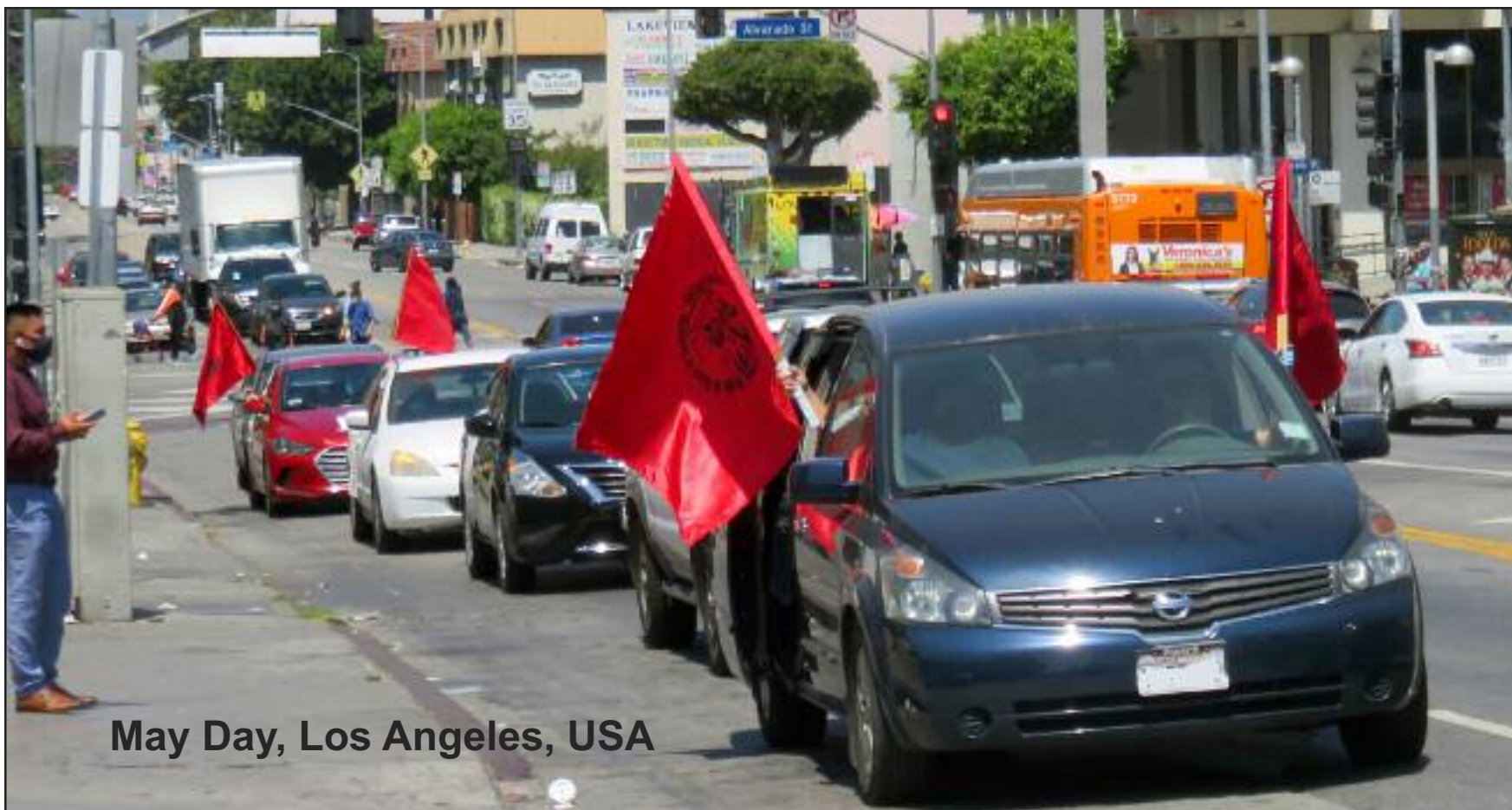
May Day, Los Angeles, USA

THE INTERNATIONAL COMMUNIST WORKERS' PARTY * WWW.ICWPREDFLAG.ORG