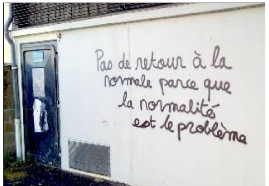
Let’s not return to normal—normality is the problem