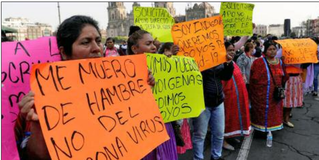
I'm dying of hunger, not from the Corona Virus