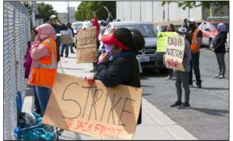
YAKIMA, USA, May 2020—Hundreds of striking farmworkers shut down production at six apple packing-house companies in Washington State. They demanded safe working conditions and hazard pay during the pandemic. Yakima County has the highest rate of Covid-19 cases in the state. Most of the workers came from Mexico long ago. Their families are the community's core.

All resources will be shared. Everyone's needs will be equally important no matter what work they do. This will be true for food, housing,