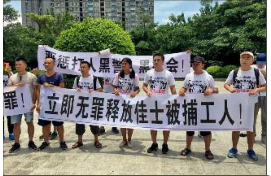
Shenzhen, 2018: Young Chinese communists demand release of detained factory workers and punishment of corrupt police.

In the mid-1960s, however, millions of rural and urban workers, led by young communists, launched the Great Proletarian Cultural Revolution (GPCR) to overthrow these capitalists and move directly to communism. They organized huge communes where money was abolished. Although defeated because of their internal weak-