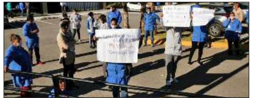
Mexicali, Baja California: "Alarms aren't essential. My life is!"

Communist revolution will ensure the security