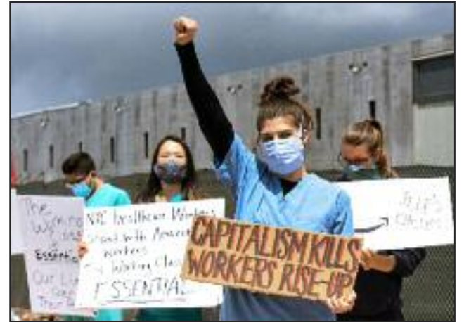
New York City, May 1 2020—Nurses support Amazon, Target & Walmart workers

Our response to the capitalist crisis must incorporate the lessons of the masks. As long as we only think about ourselves, we scrape by on our own until we go under. If we think about the entire working class, and join together to overthrow capitalism, we have a communist world to win.