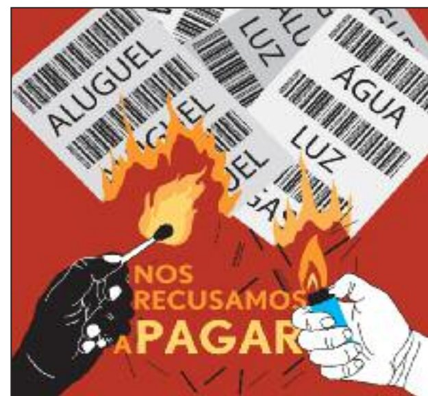
From Brazil: We Refuse to Pay—Rent, Water, Lights, Gas

Indian capitalists see an opportunity. US imperialism was too dependent on the Chinese sup-