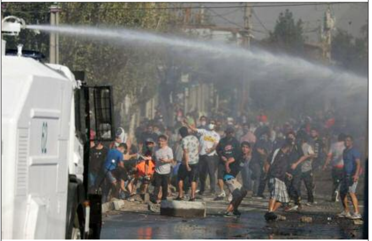
Santiago, Chile, May 18 – Youths fight carabineros in anti-government protest

These struggles of the working class, for the most part, have been spontaneous. Some have