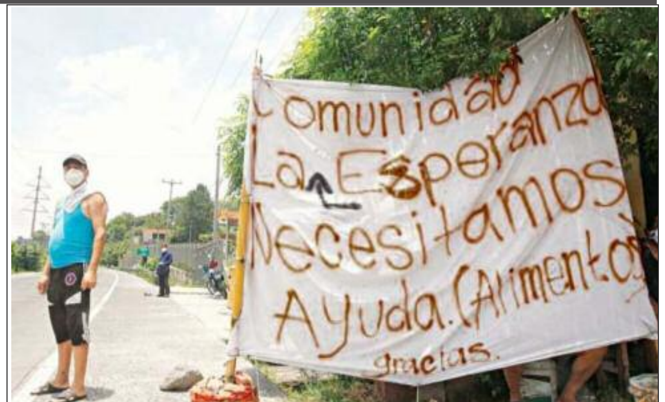
The Community of La Esperanza (El Salvador) Needs Food

Many of them explain to us that the same crisis forces us to take risks in order to buy food. But it also opens the doors for us to think ideologically