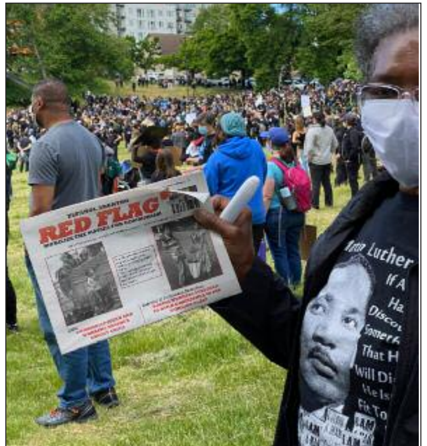
SEATTLE (US) June 7—Boeing comrades join 5,000 at the largest rally anybody can remember in the Rainier Valley, one of the most diverse working-class neighborhoods in the US. Comrades participated in at least five demonstrations last week, distributing over three hundred Red Flags and 1500 communist leaflets.