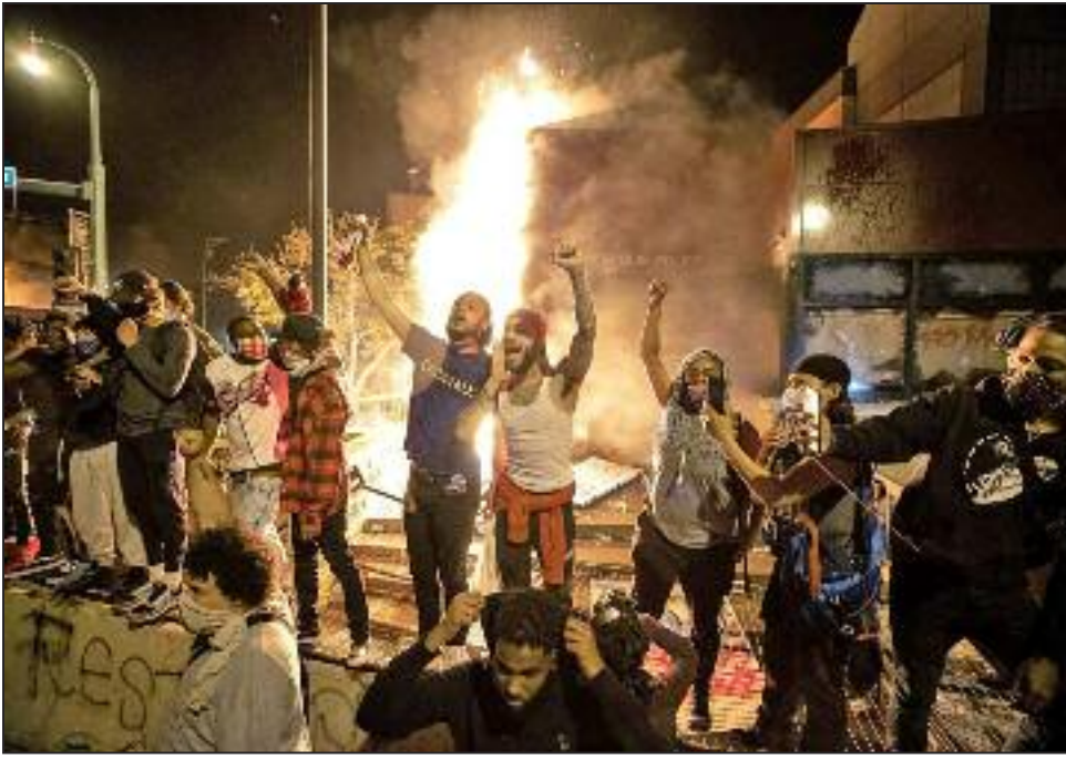
“There are simply more of them than us,” cried Minnesota governor Tim Walz as the police station burned in Minneapolis.

The solution is in our hands. To end racist police terror: Mobilize the masses for communism now!