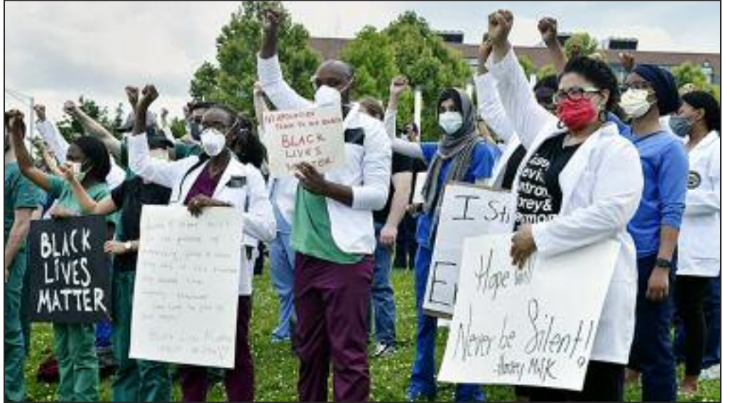
Kansas City, USA—White Coats for Black Lives

This worker had called a comrade of the International Communist Workers' Party— ( Red Flag , as we are known in the factory) and said, "The supervisors are threatening us, saying that if we don't fulfill the production quota they will fire us and send us home. They demand production of 215 dozen masks every day per module. Before, we had 30 minutes for