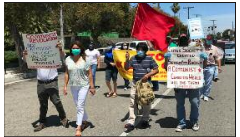
LOS ANGELES, USA