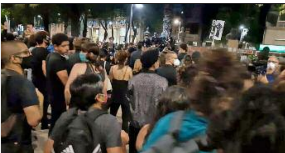
Mexico City, in front of the US embassy

The capitalist system is in crisis. It is the workers who pay with their lives so that the bosses can continue in power, enjoying their profits. Let’s get rid of them. The working class is self-sufficient to govern ourselves. We don’t need the bosses. We need a Communist system. Let’s fight to get it, and end racism, police brutality, and all the evils of capitalism.