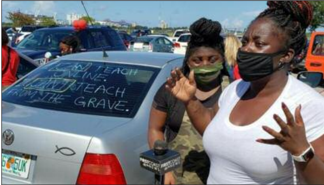
Teachers in Florida (USA) protest reckless reopening of schools as Covid-19 cases soar.

But children also learn important social values in school. Even in kindergarten, they begin to see themselves as part of society. They learn to take turns, to listen to each other, to play nice and not run with scissors. As Soviet educator Makarenko pointed out, our ties with schoolmates can become our strongest social bonds.