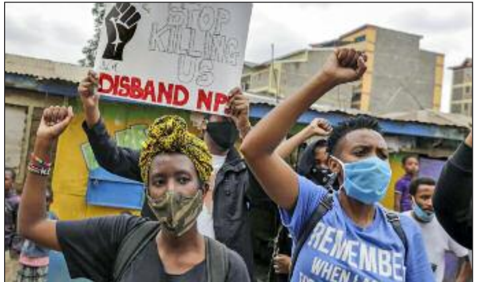
Nairobi, Kenya, June 8, 2020—Protest Against Police Brutality

In the ashes of capitalism, we need to build a society that is driven by collective effort to care, that produces things in order to meet the needs of the masses. Needs such as shelter, food and se-