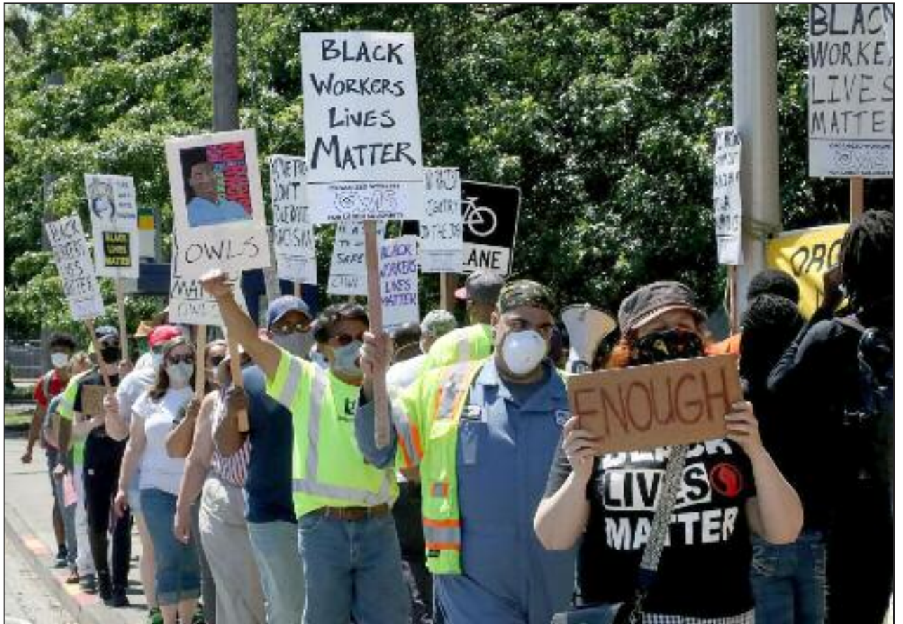
Tukwila, WA-- 200 rank-and-file Metro drivers and maintenance workers protest vicious long-term racism in the Kings County transit agency amidst another Covid-19 spike.

Red Flag reports that 55% of all young Americans and a whole lot of older folks of all races have marched against the police terror that maintains the capitalist system of oppression and exploitation. They have faced rubber bullets, police batons, and tear gas in 99 US cities.