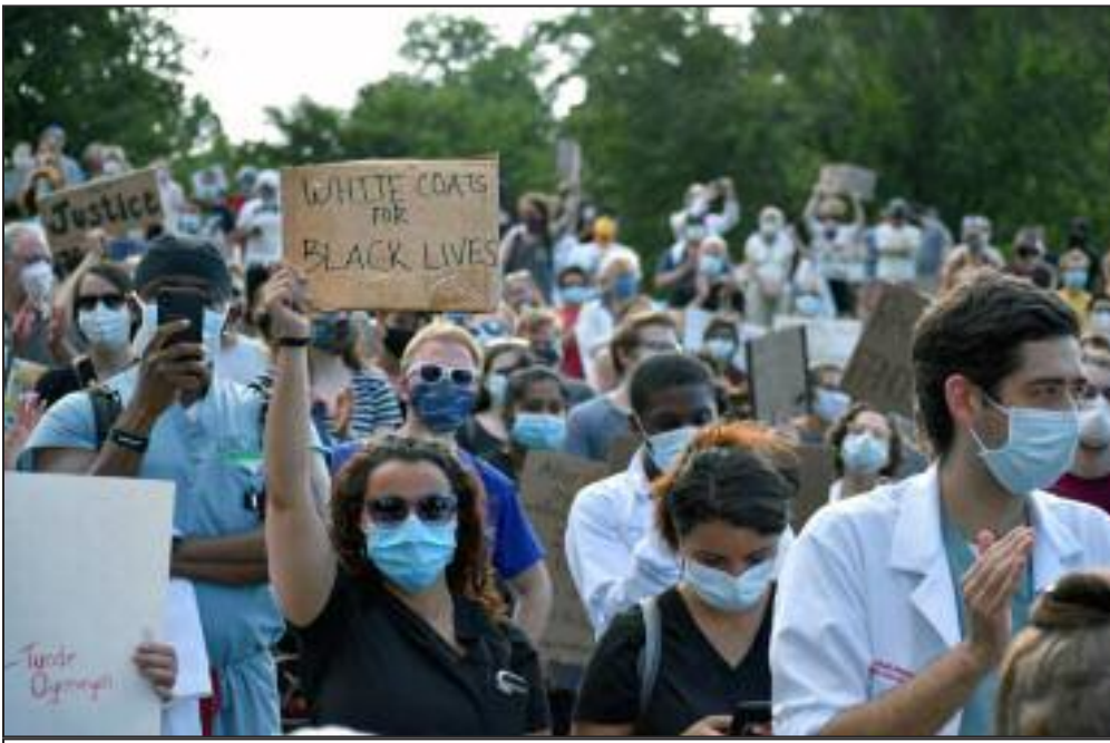
New York, June 2020—White Coats for Black Lives

Using dialectical materialism and practice, practice and more practice, we improve our understanding of society and how to transform it. And, collectively, we find and act on the best possible information about what’s safe and what’s necessary amidst the Covid-19 pandemic.