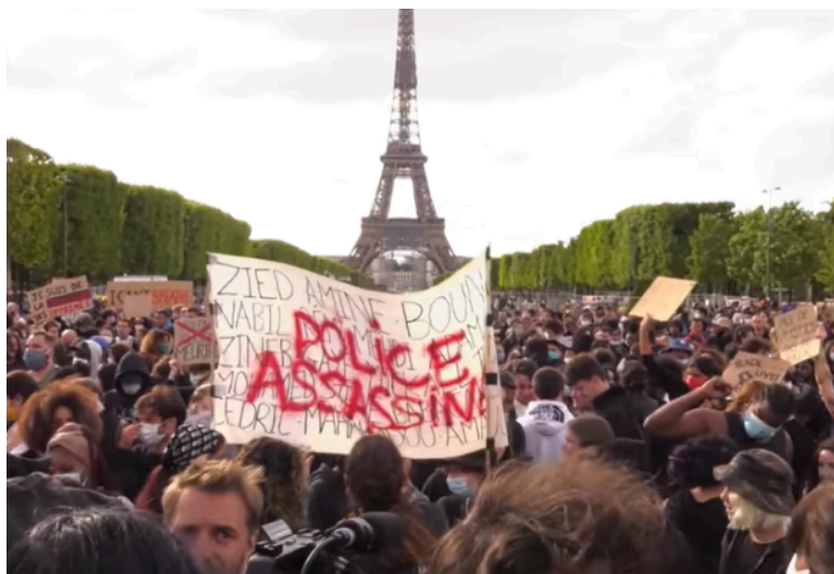
Multi-Racial Mass Protest in France Against Racist Police Murders, June 2020

The quantity of these crimes is large. This time, we have seen a qualitative change, from local protest movements to global outrage. The large number of non-black people in the protests is also a qualitative change. Change in quantity turns into change of quality, and produces a new situation of mass, multi-racial expression of hatred for the police and their capitalist bosses. That is a step closer to mass understanding of racism as organized oppression maintained by capitalists to enforce their rule over the working class.