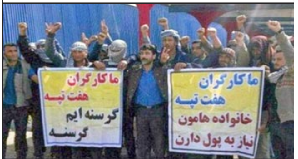
Haft Tappeh workers on strike, August 2020 "Families need money! We are starving!"