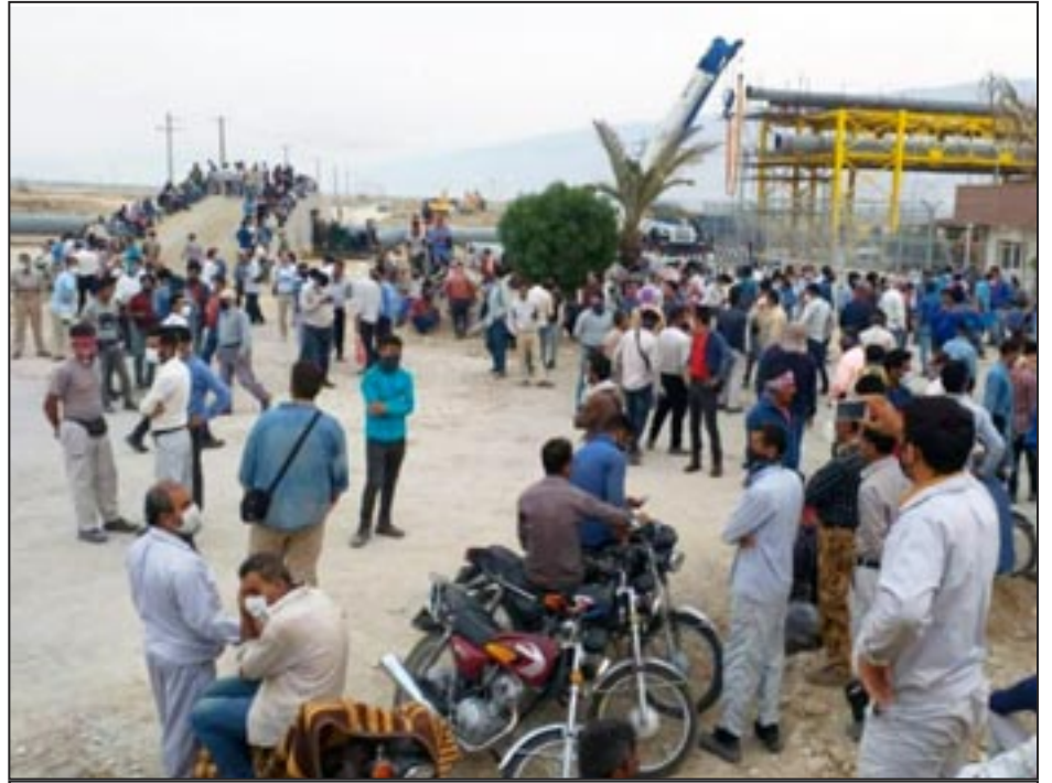
South Pars Oil workers on wildcat strike, August 2020

There won't be a privileged elite ruling over us. Instead, the communist masses will collectively decide what and how to produce and share what's needed to build a safe, sustainable future. The life of the masses will be nourished and pro-