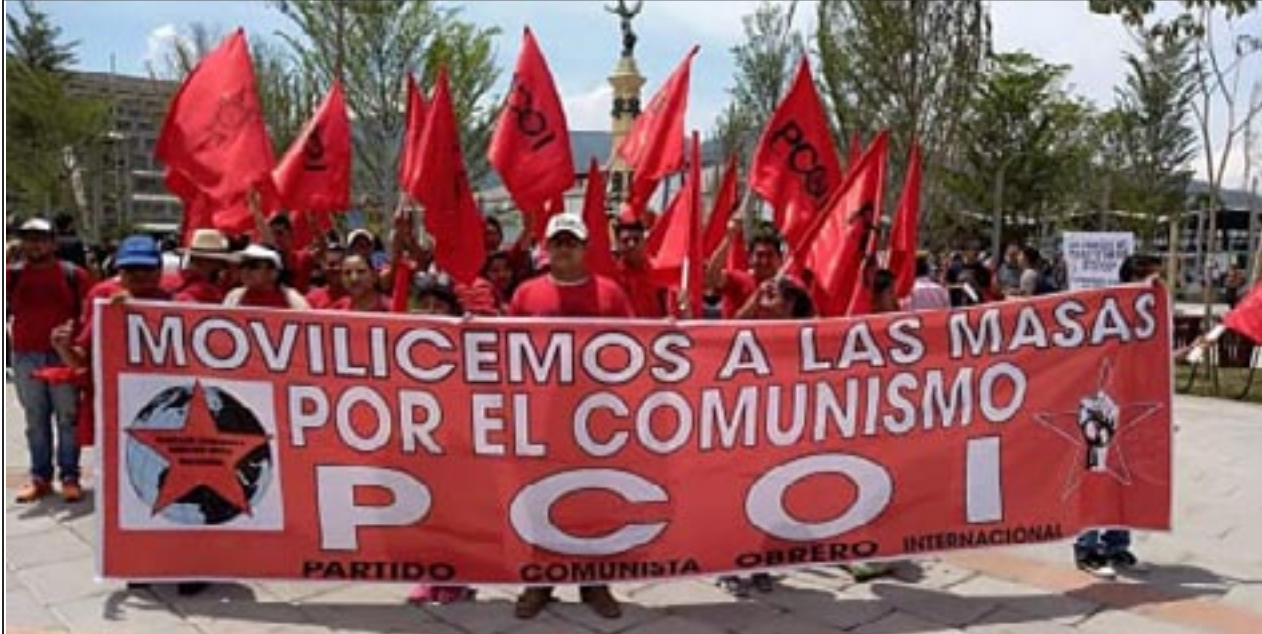
Garment workers lead the way in May Day march in San Salvador, 2016