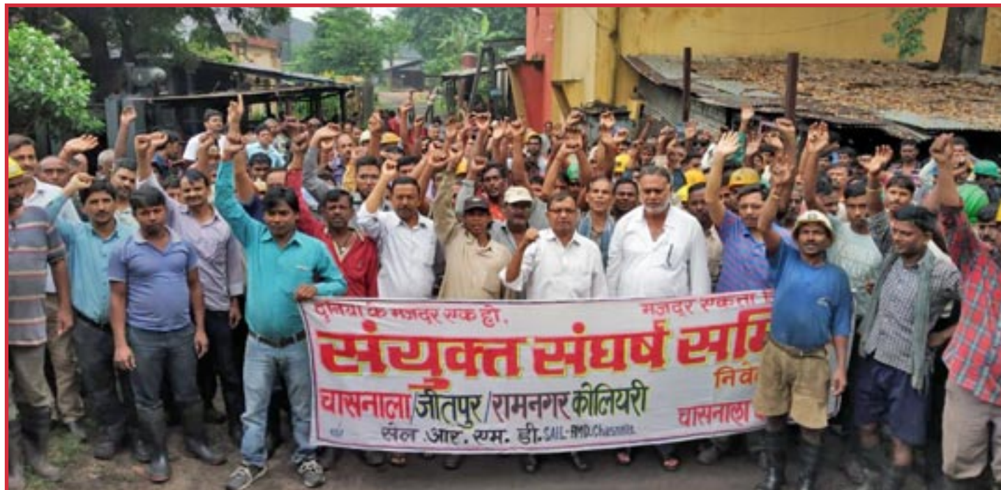
India Coal Miners Strike, 2019

THE INTERNATIONAL COMMUNIST WORKERS' PARTY * WWW.ICWPREDFLAG.ORG