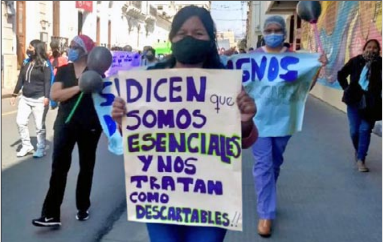
San Salvador, September 2020—They say that we’re essential and they treat us like we’re disposable