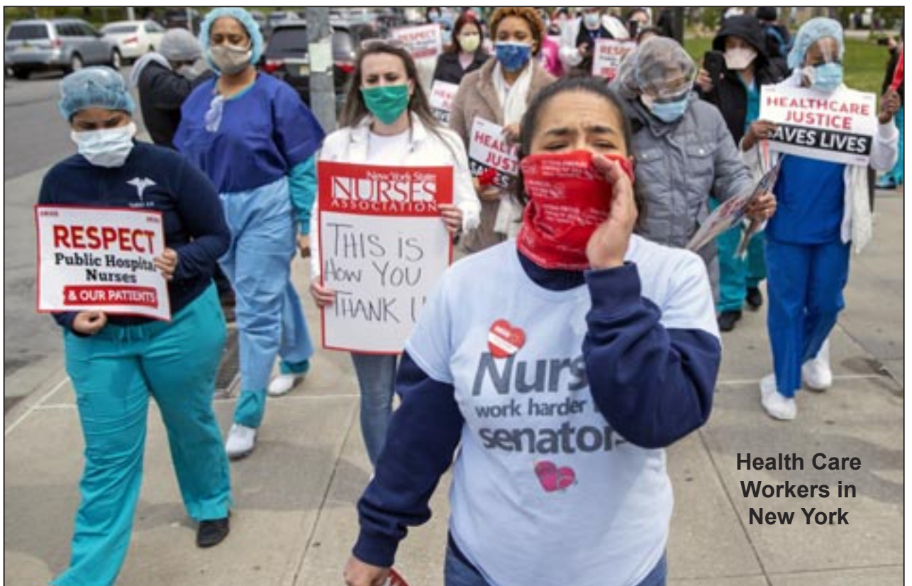
Health Care Workers in New York