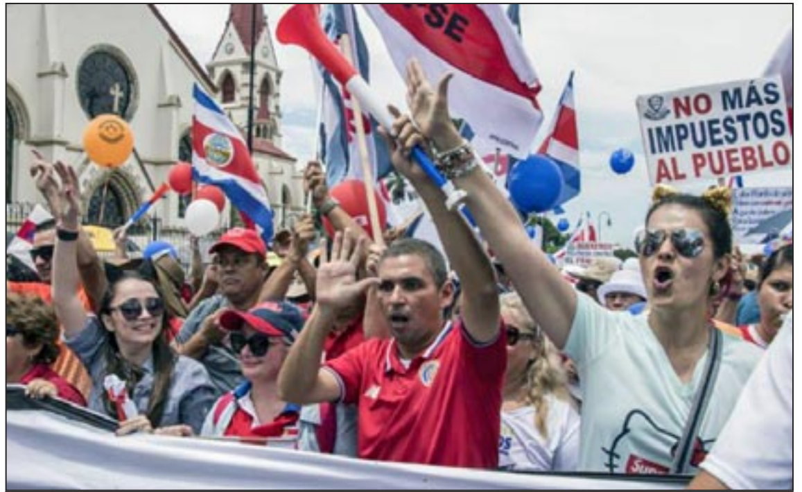
No more taxes on the people!

It is the duty and honor of our comrades in Central America to bring to the Costa Rican working masses the message that the only solution is to mobilize for communism. That we and they need to join and organize the