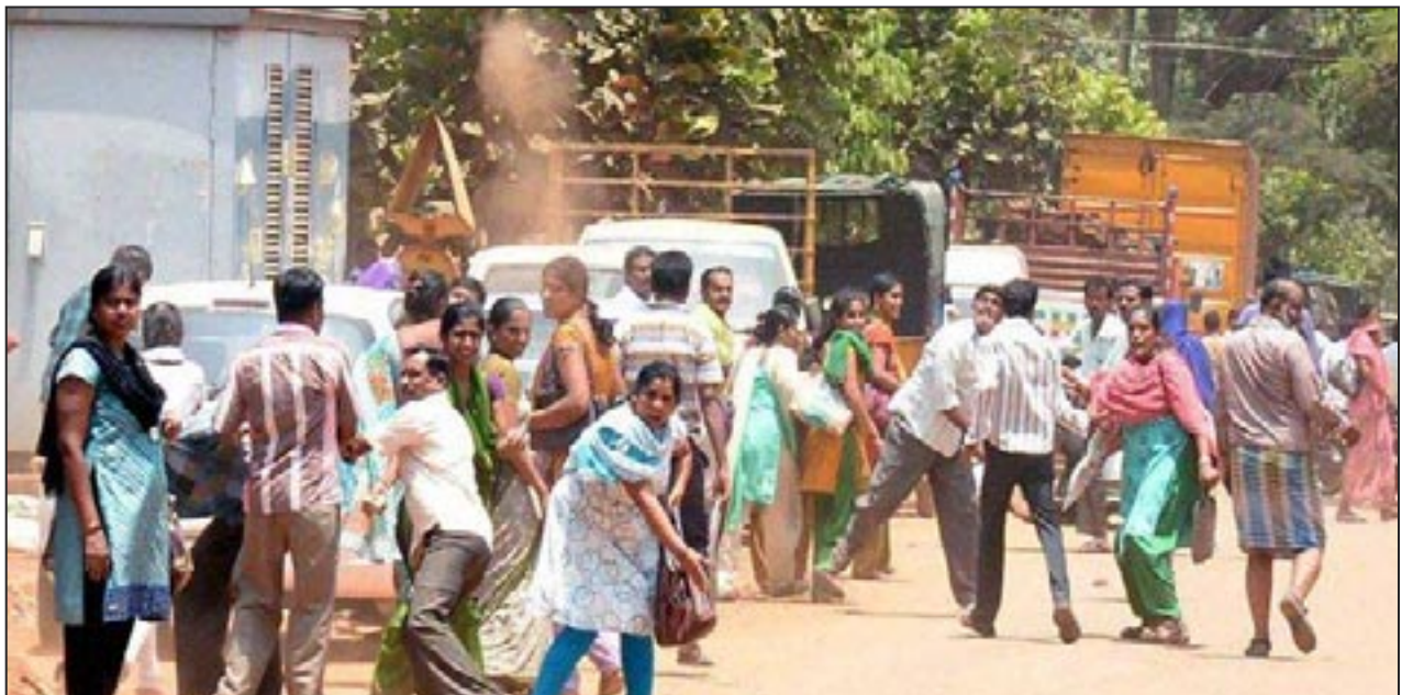
Garment workers, Bengaluru, India, 2016

We distributed this communist leaflet in the Hindi and Kannada languages to our neighbors in the garment districts. Many were incredibly