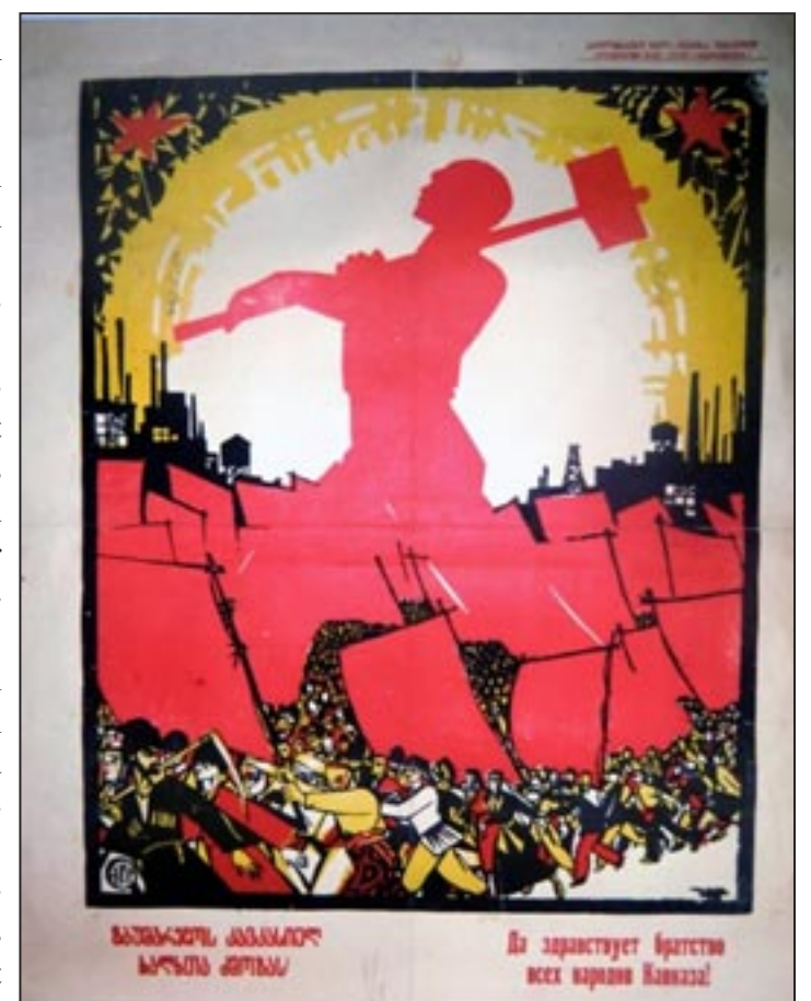
1921 Soviet Era poster in Russian and Georgian: Long Live the Brotherhood of all Caucasus Nations

Workers of the world, unite for communism! No borders! No nations!