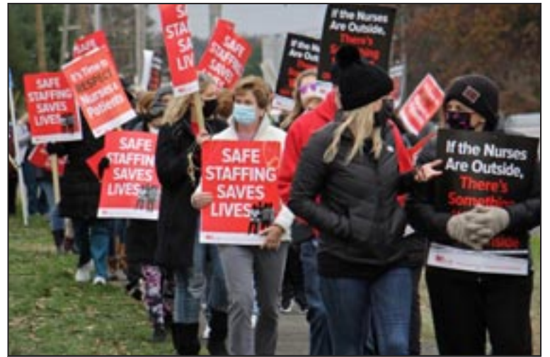
Lancaster, PA USA, November 21 Nurses strike for increased staffing

The pandemic has made it clear: communist revolution is a life and death issue for tens of millions of people worldwide.