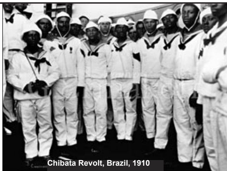
Chibata Revolt, Brazil, 1910

“In the Chibata revolt, 110 years ago, sailors, mostly Black, completely paralyzed the entire