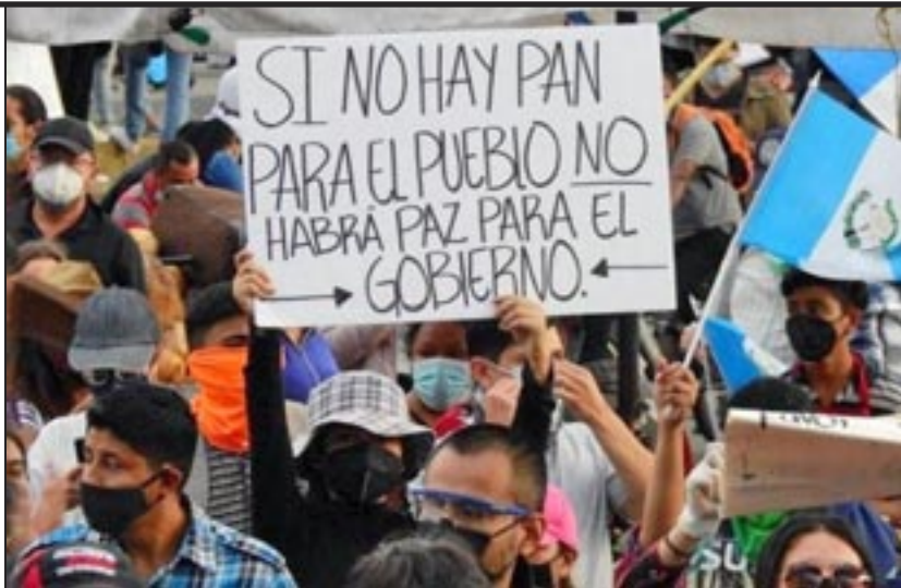
“If there’s no bread for the people, there will be no peace for the government”

GUATEMALA, November 21—Protests erupted against the new general budget approved by the Guatemalan parliament. The crisis began when the working class repudiated cutbacks to healthcare programs. The protests of students and workers show the decisive power of the masses when it comes to confronting the politics of the state.