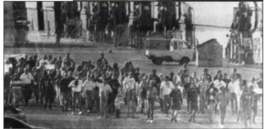
Boeing workers march through factory, October 2001