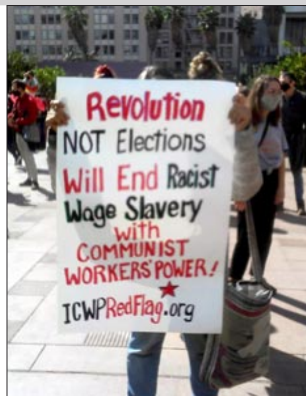
Los Angeles, USA, November 7

Whenever and wherever the party succeeds in mobilizing masses to establish communist workers’ power, this is how our “liberated zones” will function. We’ll throw out ballot boxes and elections along with money and markets. We’ll strive for consensus (or near-consensus) in a growing