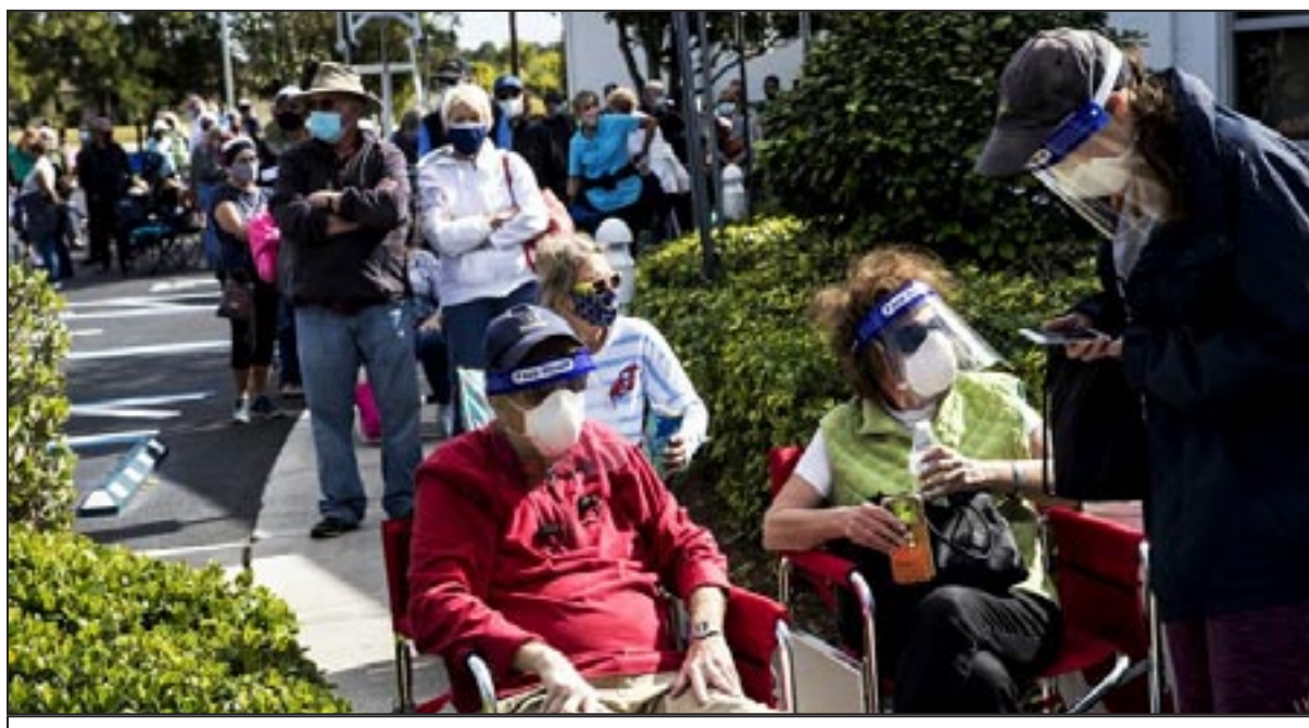
Florida, USA—Waiting in line for the COVID vaccine

cles on the 1918 flu pandemic in Seattle. One article blamed the spread