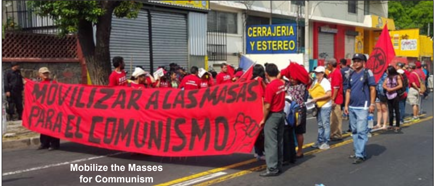
Mobilize the Masses for Communism