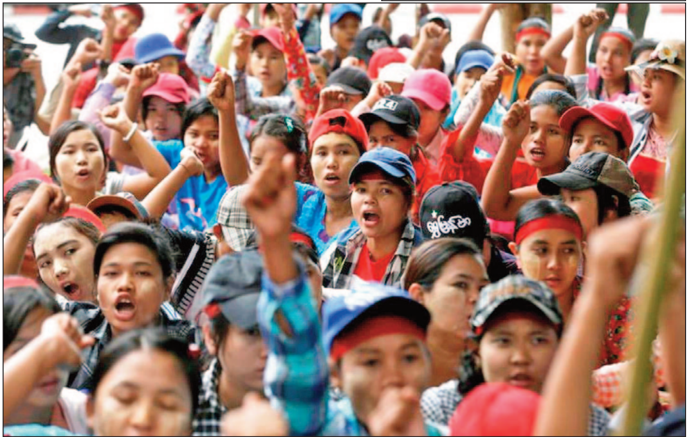
Striking Garment Workers in Myanmar

Some non-Rohingya workers, youth and others in Myanmar are openly self-critical for failing to support their Muslim neighbors. This is changing. Since the coup, Rohingya in Bangladesh and in Myanmar – notably including the AA – support the mainly non-Rohingya anti-coup protests.