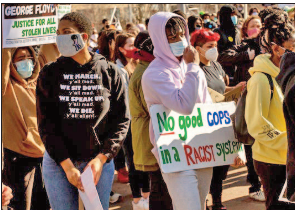
MINNEAPOLIS (USA), March 19—Protests over the racist murder of George Floyd continue during the trial of killer cop Derek Chauvin. Heart-breaking testimony from witnesses, young and old, exposes the constant racist terrorization of Black people by police in the US. Masses are rightly outraged. Whatever the outcome of the trial, there is no justice and no peace under capitalism! Only communist revolution can achieve the mass demand, “Abolish the Police.” Only the abolition of wage-slavery can end the material basis of racism worldwide.

We need communist culture and organizing—not for unions but for revolution.