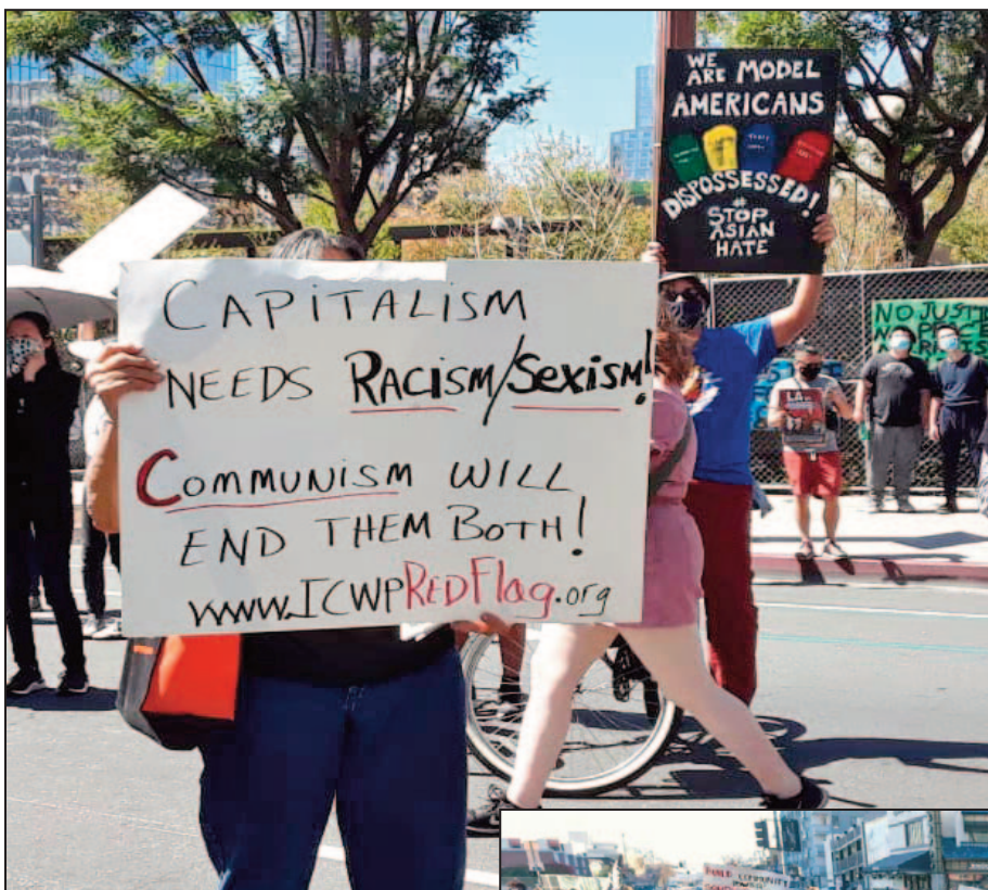
Rallies Against Violent Attacks on Asians LOS ANGELES (US), March 27 (Above) March 13 (Right)