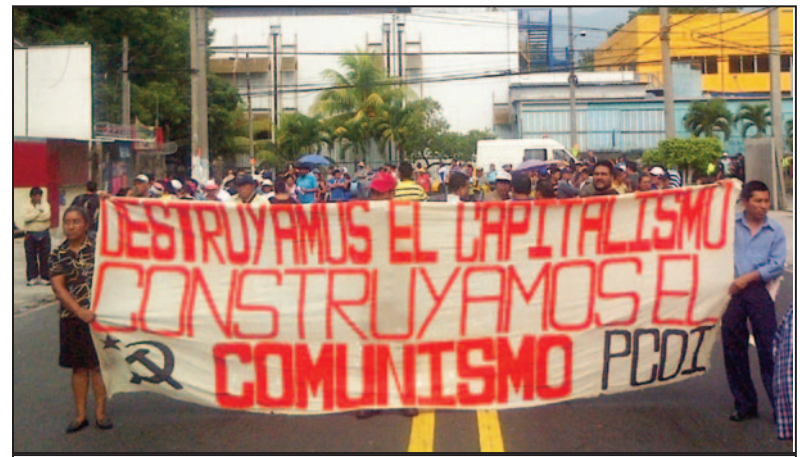
Let's Destroy Capitalism & Build Communism ICWP

The bosses are only interested in us giving our labor power to them to generate their production, to absorb all our time and labor, while they keep all the profits. In communism, production will be generated according to the needs we have. We will have more time for our families and friends.