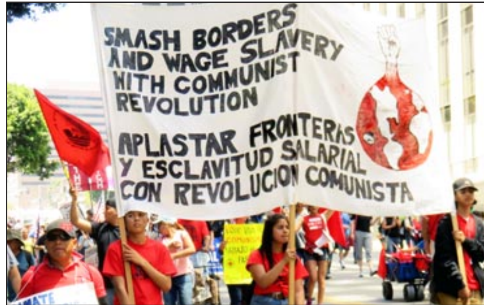
that we, the working class, are one.

The class solidarity shown by many in Mexico, the US and Europe to immigrants from Central America, the Caribbean, Asia and Africa has dealt a blow to racism and nationalism. It shows