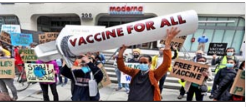
CAMBRIDGE (USA) Protest at Moderna headquarters

Another comrade has been discussing Gates, capitalism and the pandemic with his extended