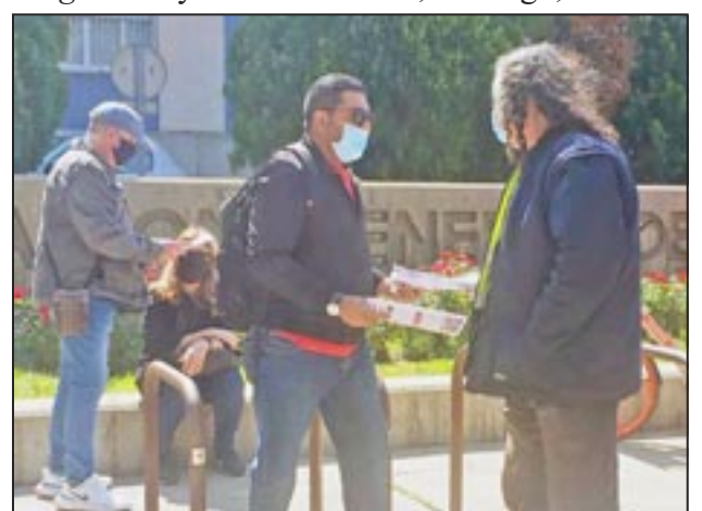
ZARAGOZA (Spain), May 1— Four ICWP comrades went to two marches, one organized by trade unions, the other by anarchists and the revisionist Spanish CP. They passed out all 500 copies of Red Flag they had printed and stapled together. Two of the comrades had read the paper before, but this was their first activity with us.

A worker who marched on May Day for the first time said, "I was afraid to come, because a union leader told me, 'If the people from Red Flag invite you to the march, don't go, because