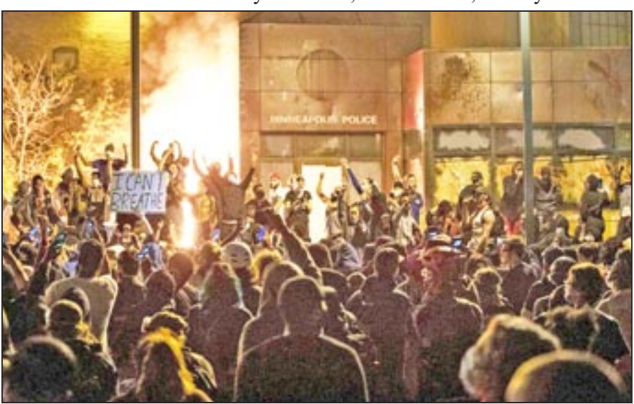
MINNEAPOLIS, (USA), May 28, 2020—Protesting the racist murder of George Floyd, angry masses burned Minneapolis Police Station #3.

Mass protests against racist police murders continue and will escalate. Wherever possible, we must organize communist actions against racism and bring communist ideas to rallies and marches organized by others. The contradictions in the capitalist system and among the capitalists create opportunities for our Party to grow significantly in the US, as elsewhere, in the year ahead.