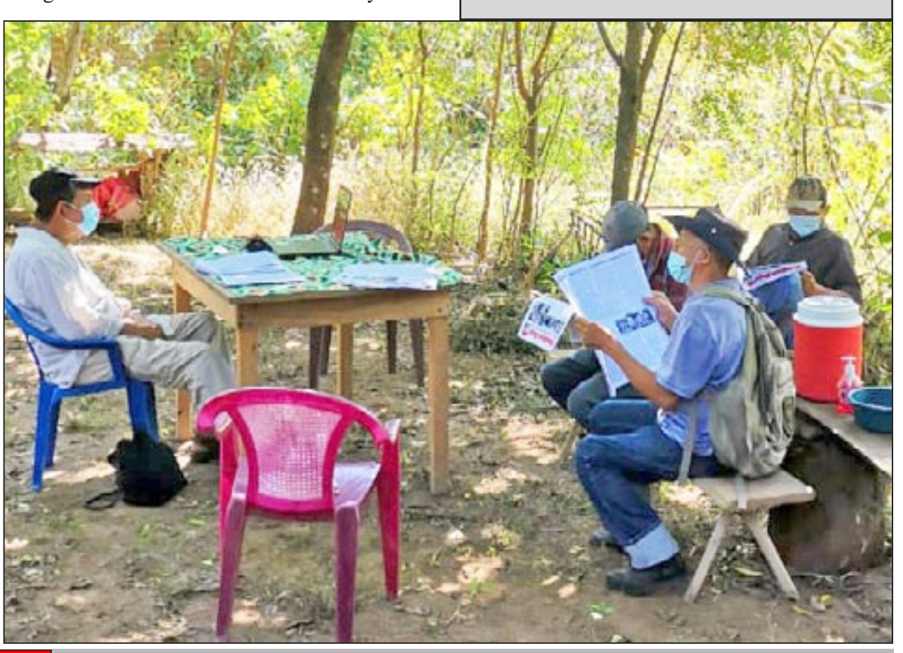
Volume 12, Number 8 June 22 to July 15, 2021

During the whole meeting, we were enjoying a snack and then we said goodbye.