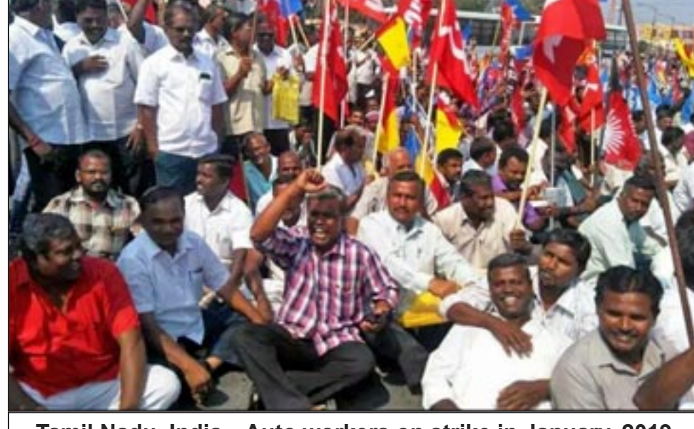
Tamil Nadu, India—Auto workers on strike in January, 2019

Discussions like these have inspired new comrades to talk more seriously about our work. It becomes clear to us that we need to have a soci-