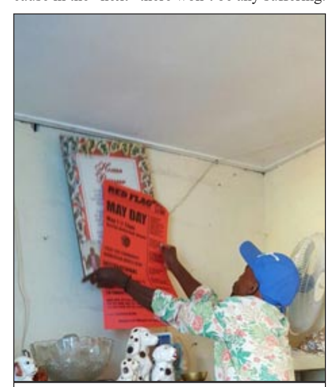
This photograph, from South Africa, April 2017, shows a comrade posting the ICWP May Day poster in his home, covering a framed prayer.

cause it holds the working class back. We need, as communists, to create heaven on earth by ending exploitation, racism, sexism and poverty in our lifetime. We must fight this Christian belief that it is okay for workers to suffer in this life because in the "next" there won't be any suffering.