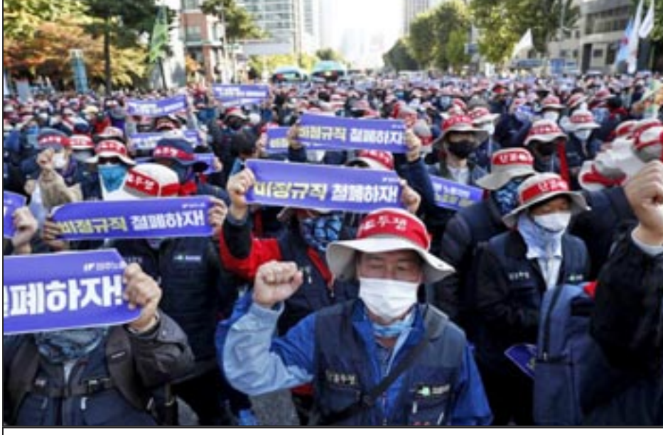
South Korea, October, 2021: One Day General Strike

Communism will thrive on unity and eliminate competition among workers. Thus, it can end racism, sexism, xenophobia, and all the "isms" that capitalists use to divide us, dilute our power, and maximize profits.