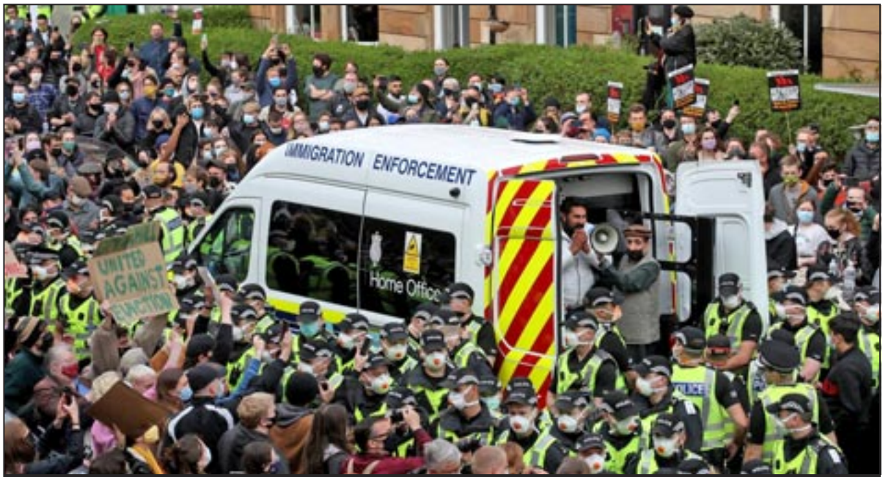
May 2021 Glasgow, Scotland: Hundreds prevent immigration authorities from taking two migrants

The rise of capitalism brought the nation state, which local capitalist classes used to build their industry and commerce. Nations were supposedly based on a common language, culture, tra-