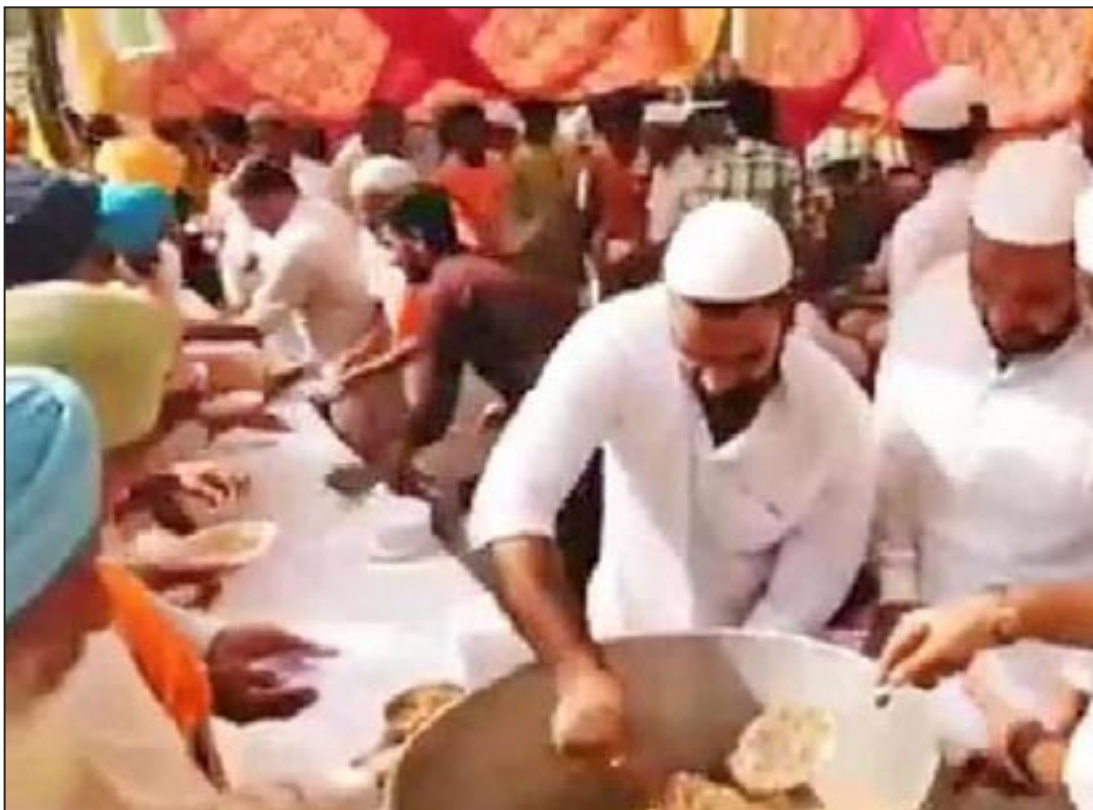
Muslims arrange langar for Sikh farmers

She and comrades like her are leading ICWP and the masses now, and more will in the future. Modi's fascism is creating conditions for us to expand the base for communism in India and around the world. Our new comrade and her collective are preparing a message of solidarity to our comrades in El Salvador. Their message will reverberate around the world, signaling communist potential and a bright future.