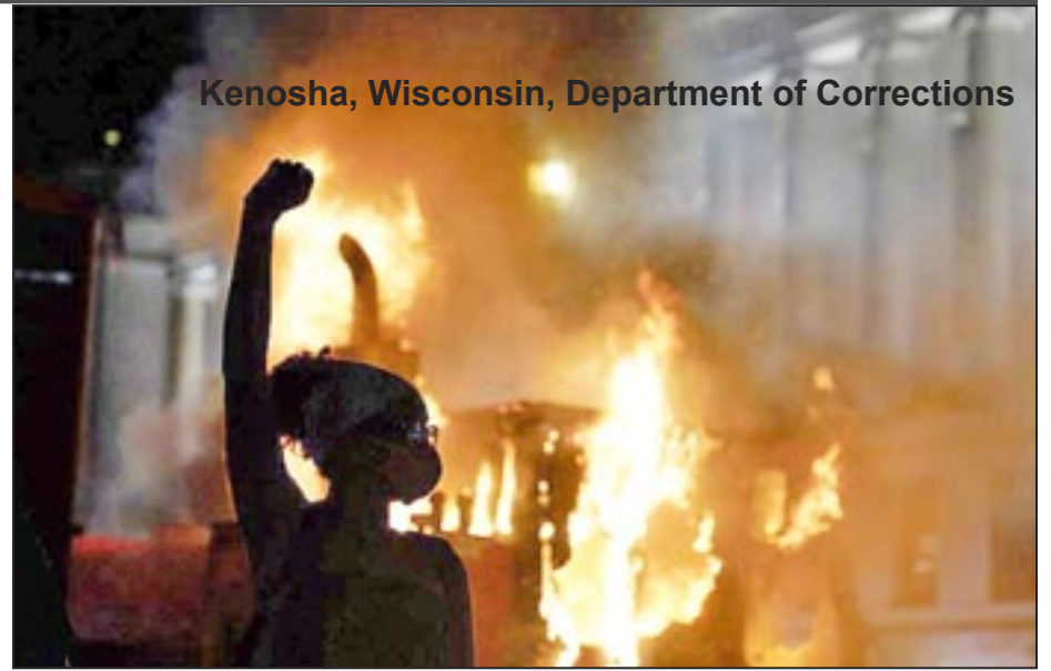
Kenosha, Wisconsin, Department of Corrections

In November I distributed Red Flag to picketing Kaiser workers in Oakland (USA). They