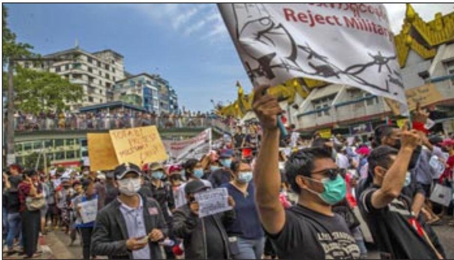
YANGON (Myanmar)— Thousands defy military police, fighting to end the military dictatorship installed by the February 2021 coup.

Yes, it's worth it! Communism – not democracy – is our response to fascism and our only hope for the future.