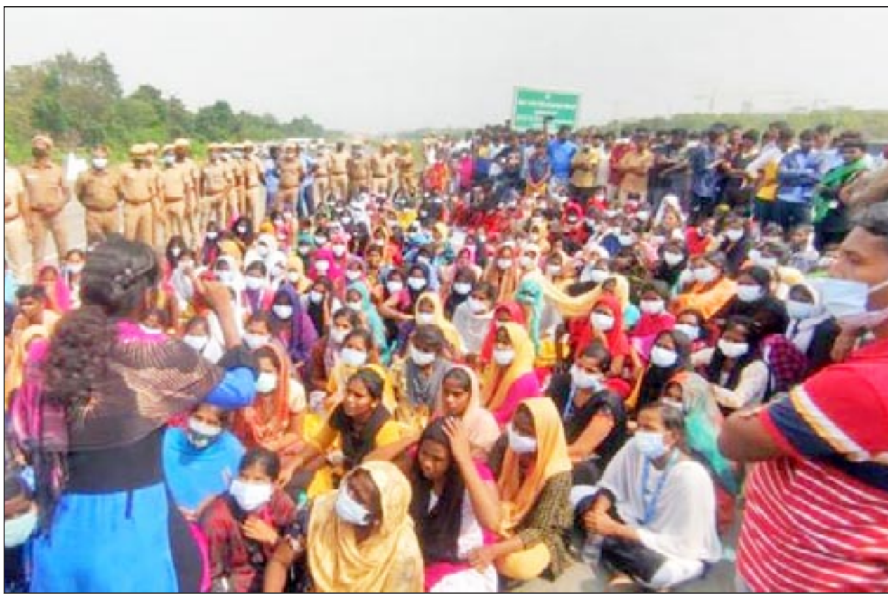
Chennai, India, Dec. 18, 2021: Foxconn factory workers protest contaminated food

Only communists have the outlook to destroy this system. We are planning a meeting in India next month. One working-class, one party, one fight, communism! Onward comrades!