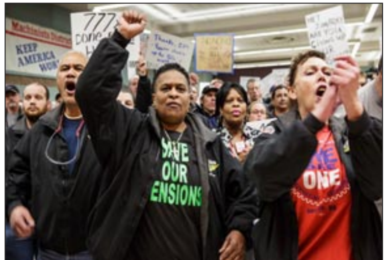
January, 2014—Boeing machinists rally against a proposed eight-year cut-back contract

Each new member of the ICWP speeds the demise of racist capitalism and its anti-working class, nationalist lies. Every close personal and political relationship our members make amid class struggle hastens the day the words of The Internationale become a reality.