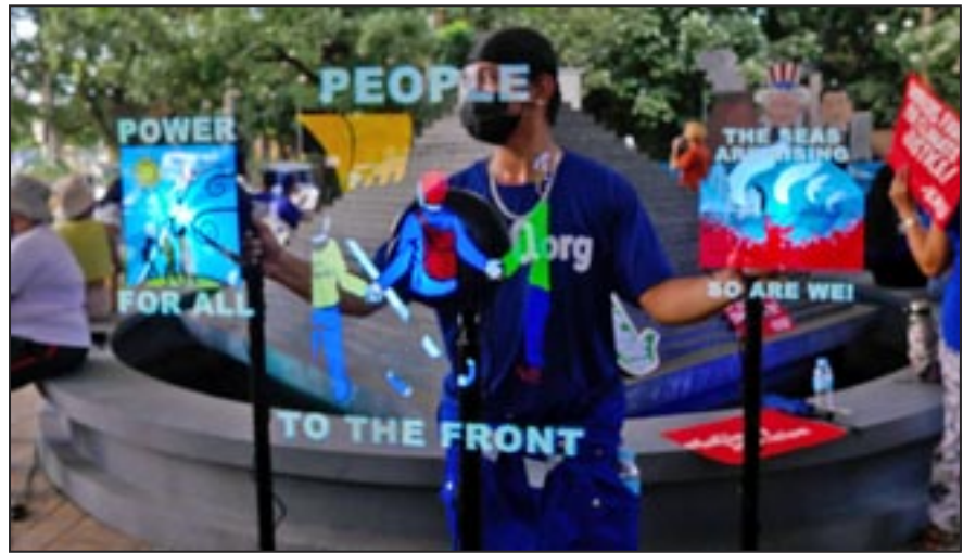
Nov. 6, 2021 Climate protest, Quezon City, the Philippines

Communism will empower us to take collective control, of our workplaces and our world. By joining the International Communist Workers Party, every one of us can help to bring this about— before it’s too late.