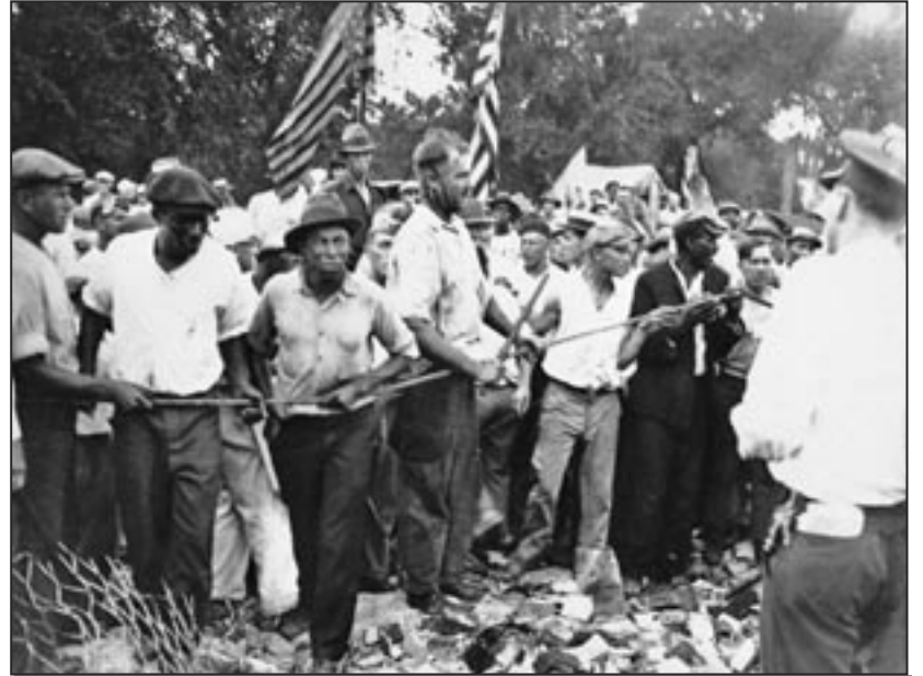
1932—Black and white veterans of World War I march on Washington to demand compensation for their military service, attacked by the US Army and fighting back.

He rejects the idea that “freedom comes from knowing their own his-